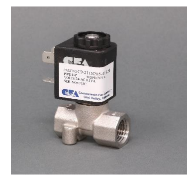
C9 & C4 Direct Acting 1/8", 1/4", 3/8" Brass or 316 Stainless Steel 0 to 2030 psi Water 0 to 50 psi Steam