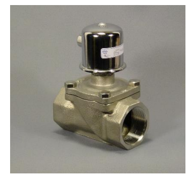
S27 Zero Differential 1" to 2" Brass or 316 Stainless Steel 0 to 100 psi Water 0 to 50 psi Steam