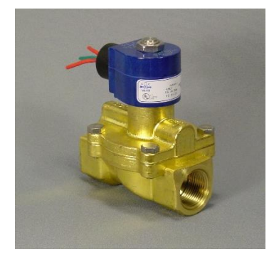
S21..T4 Piloted Diaphragm 3/8", 1/2", 3/4" Brass 10 to 250 psi Water 10 to 100 psi Steam