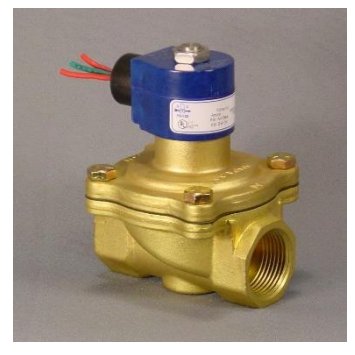
S20 Zero Differential 3/8" to 1-1/2" Brass or 316 Stainless Steel 0 to 140 psi Water 0 to 50 psi Steam