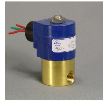
S30 & S31 Direct Acting 1/4", 3/8", 1/2" Brass or Stainless Steel 0 to 2400 psi Water 0 to 50 psi Steam