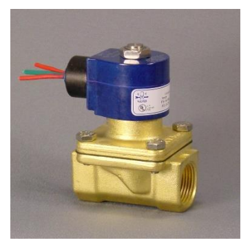
S21 Piloted Piston 3/8" to 2" Brass or 316 Stainless Steel 4 to 150 psi Water 4 to 50 psi Steam