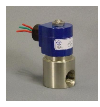
S40 Piloted Piston 1/8", 1/4", 3/8" Brass or Stainless Steel 0 to 300 psi Water 0 to 50 psi Steam