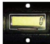
DIGITAL COUNTER & ENCLOSURE