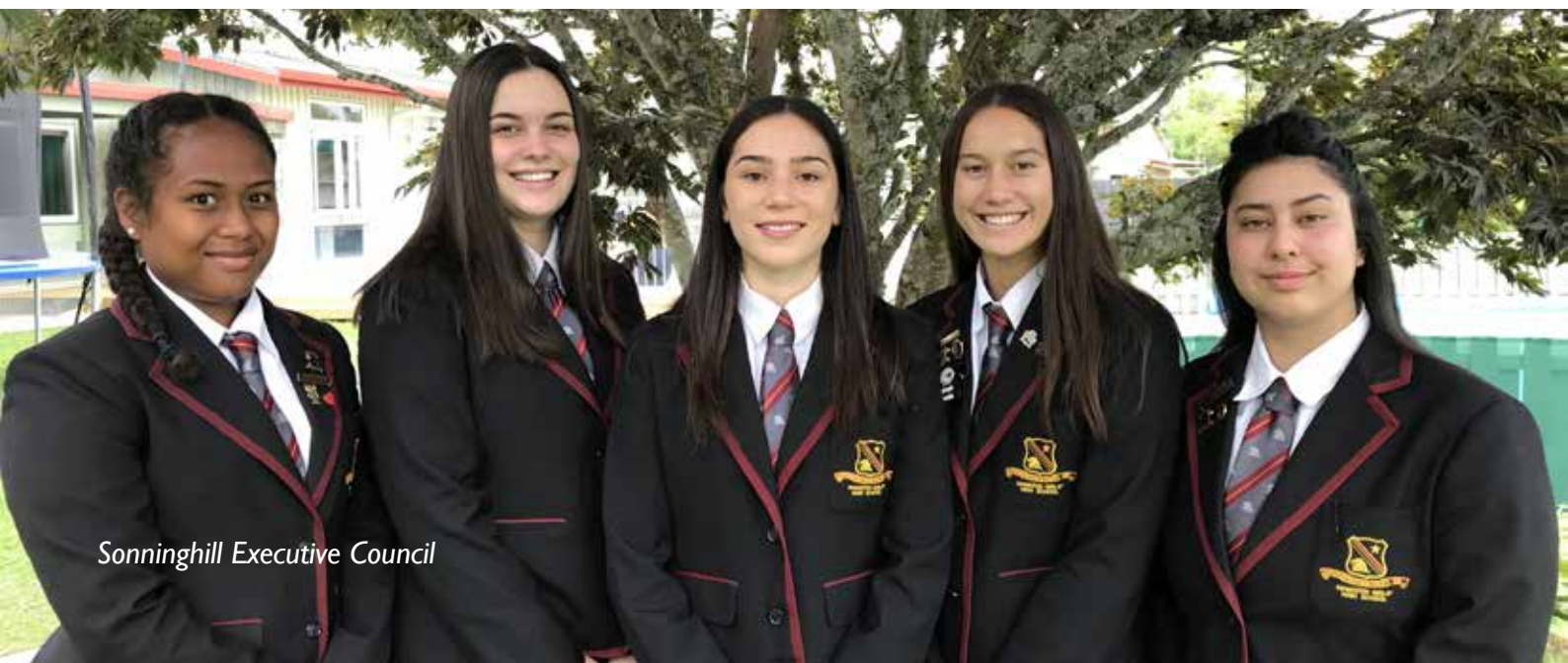
Sonninghill Executive Council