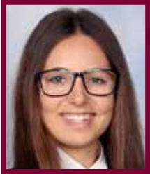
Darien Lee Scholarship in Design and Visual Communication