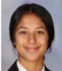
Arorangi Tauranga Rugby Sevens U18 New Zealand team 2017 U18 NZ team 2018 (Rugby Sevens)