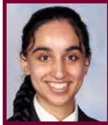
Simron Mann Scholarship in English