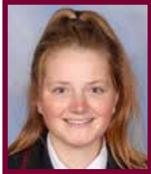
Rebecca MacPherson Scholarship in English