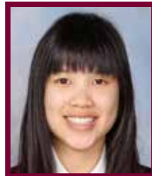
Maywen Choy Scholarship in Mathematics with Statistics