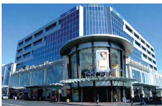
Broadway - Newmarket