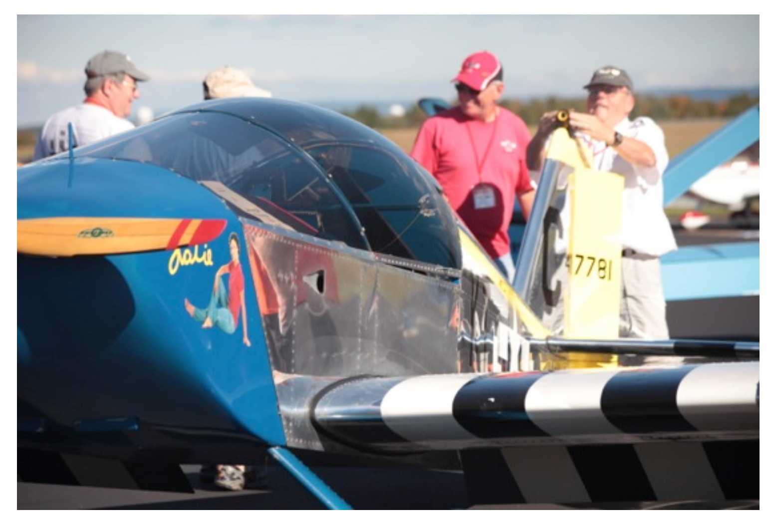
ELT – AmeriKing – AK–450 ELT

Engine Info System – Stratomaster Model: HX Air-Oil Separator – Mika Mark II