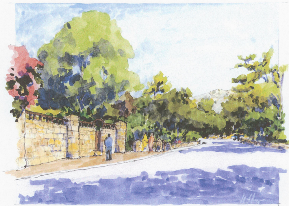
MT. CALVARY MONASTERY WALL / WEST PEDESTRIAN BRIDGE ENTRY