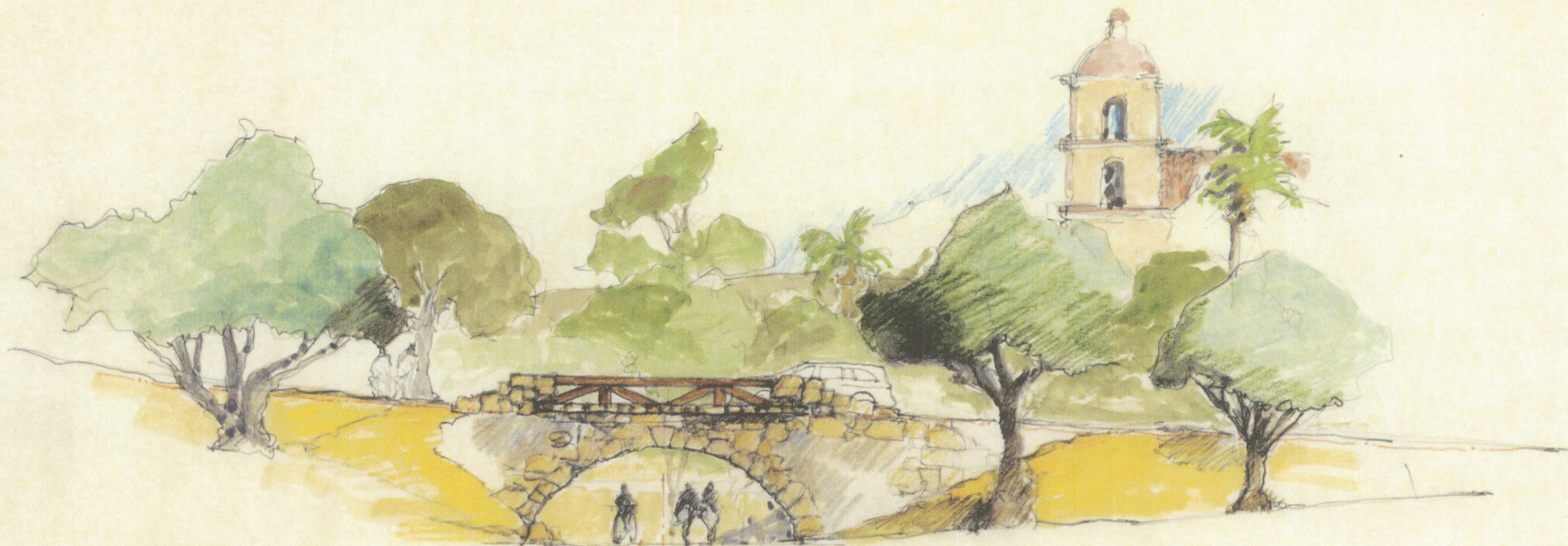
'THE ARCH' ALAMEDA PADRE SERRA OVER MISSION HISTORIC PARK.