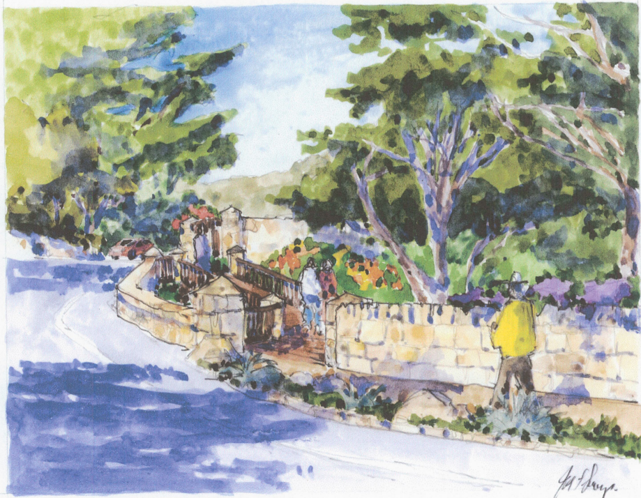
MISSION CREEK BRIDGE and NEW "WEST" PEDESTRIAN BRIDGE