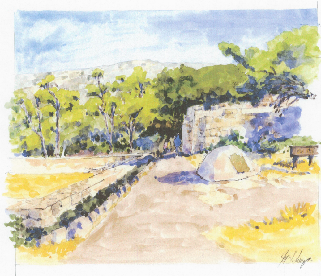
EAST CORRIDOR PEDESTRIAN PASSAGE AT RESERVOIR / GRIST MILL.