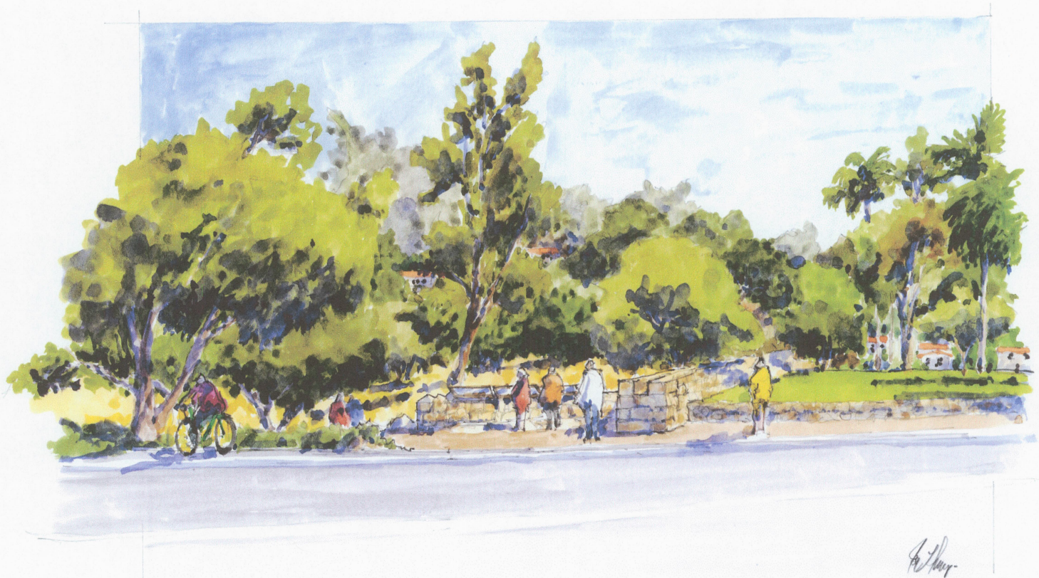
HISTORIC PARK OVER LOOK PLAZA.

MISSION HERITAGE TRAIL ASSOCIATION "SAFE PASSAGE" JUNE 20, 2014