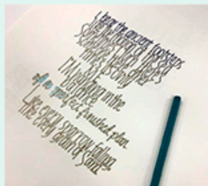
Monoline meeting Jan '23