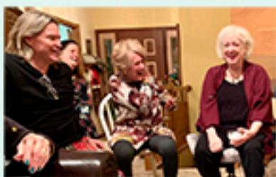
2022 Christmas party