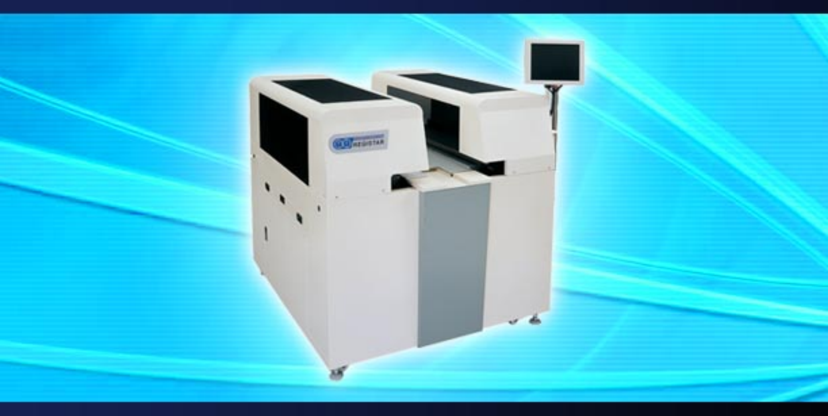
Superb Precision. Better Quality. Top Value. REGISTAR series

By using the REGISTAR series TY-800 automatic register punch and plate bending system, your skilled press operator does not need to worry about unit-to-unit nor about axial (cocking) register problems.