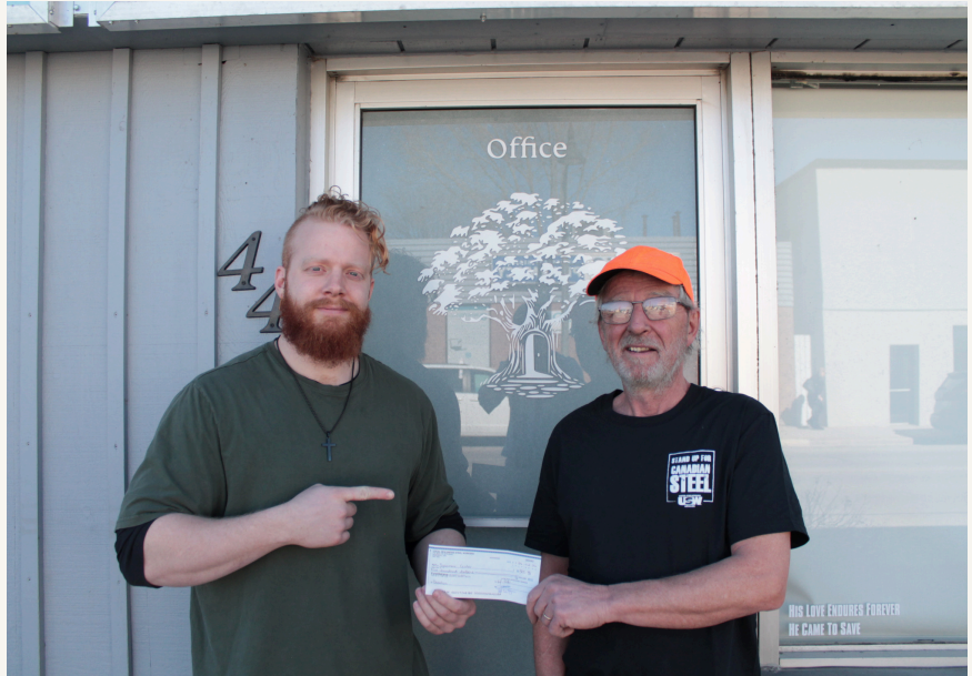
Big thank you to United Steel Workers Union for their donation this month!

The Sycamore Centre is a safe, welcoming place where anyone can rest, receive practical help, and experience the love of Christ through genuine community. Every week, lives are touched through simple acts of compassion, dignity, and connection. Since the Sycamore Centre opened its doors on August 6, 2025, we have now provided over 2,200 meals, more than 475 showers, and nearly 300 loads of laundry to individuals and families in need. Each meal served, each shower offered, and each moment of care reflects our mission to walk alongside people with hope, respect, and steady support.