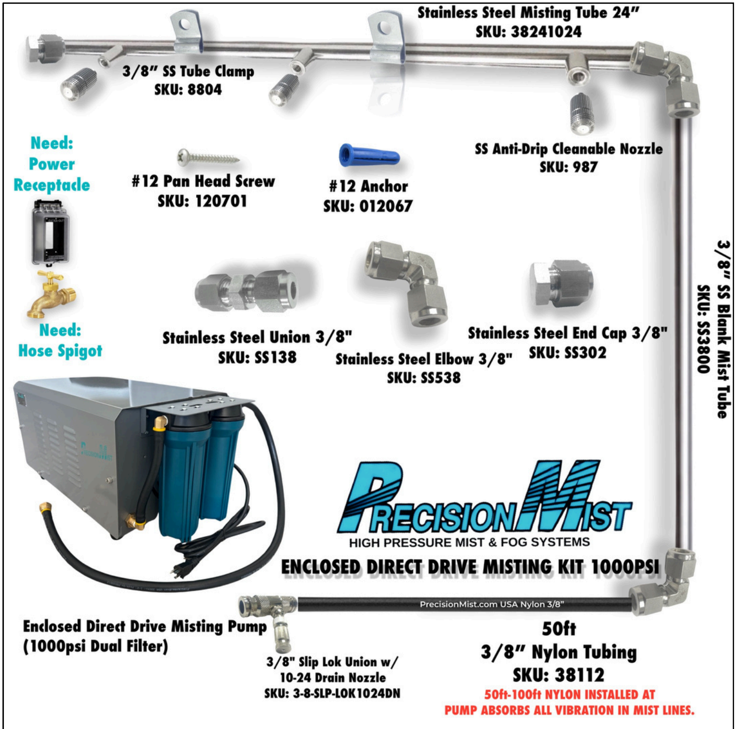
Stainless Steel Misting Tube 24" SKU: 38241024