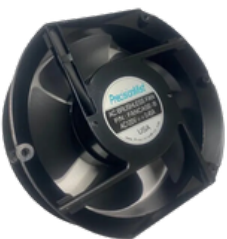
Axial Cooling Fan 6-3/4" 120V SKU: 90007