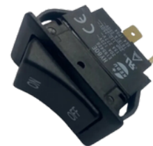
Rocker Switch, DPST, 20A 4 Connections SKU: 91009