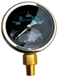
1/4" NPT Liquid Filled Pressure Gauge 2000 PSI 2.00" (Thread on bottom) SKU:90020

Unplug pump power cord, shut off water supply, remove filter bowl and drain water. Drain water out of all lines using compressed air to prevent freeze damage.