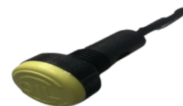
Pump Oil Dip Stick SKU:888011