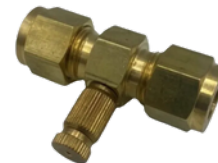
3/8" Brass Compression Union w/ Drain Nozzle SKU: BR433