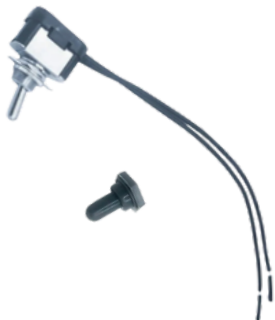
On/Off Toggle Switch DPST SKU: 90019