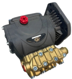
Direct Drive Pump Head SKUs: PRM1502H - 0.25GPM PRM1802H - 0.5GPM PRM1505H - 1.0GPM PRM1507H - 1.5GPM PRM1509H - 2.0GPM PRM1809H - 3.0GPM