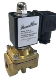
Electric Solenoid Valve 120V 3/8" FNPT SKU: ES117