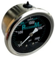
1/8" NPT Liquid Filled Pressure Gauge 2000 PSI 1-1/2" (Thread on back) SKU:90022

Unplug pump power cord, shut off water supply, remove filter bowl and drain water. Drain water out of all lines using compressed air to prevent freeze damage.