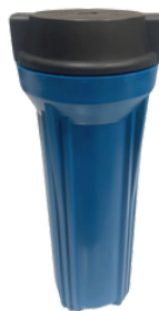
10" Water Filter Black/Blue 3/8"FNPT SKU: FBB11