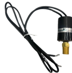
Low Pressure Sensor 120v SKU: 90000