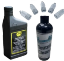
Misting System Service Kit (Scale X, Carbon, Sediment Filter) SKU: MK10110051