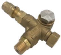
Pressure Regulator 3/8" SKU: 91008