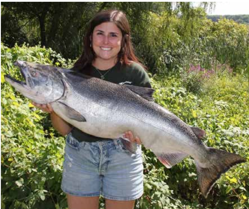
Final Day Catch Wins Grand Prize for LoPresti “It was meant to happen.”

Win Your Share of $140,150 Guaranteed CASH in 2026!