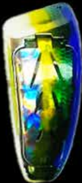
EP2-809 Blue Ice