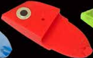
4701 Red Sparkle