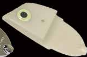
4712 Glow White