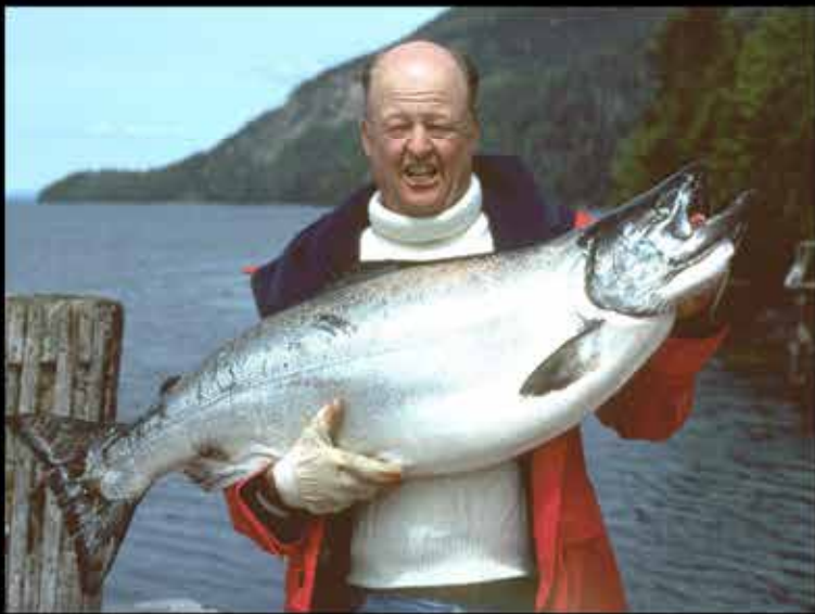
This record 75 lb. chinook was caught near Ketchikan, Alaska