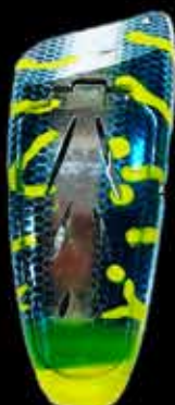
EP2-805 Sea Tiger