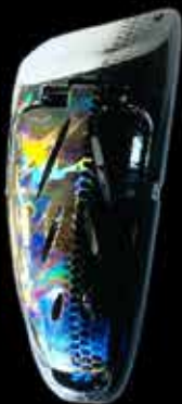
EP2-801 Black Jack