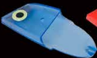
4700 UV Clear