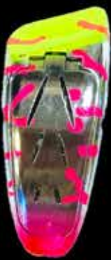
EP2-804 Pink Tiger