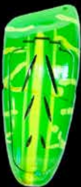
EP2-803 Green Tiger