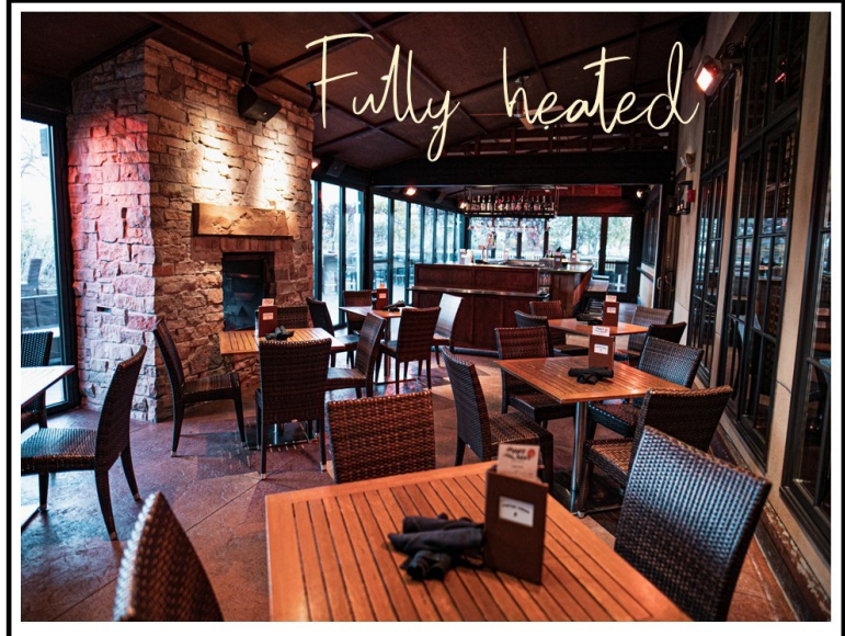
ENCLOSED PORTICO & BAR

Popular due to the intimate nature of the space with carpet and lower ceilings, while open to the restaurant on one side. Perfect for a personal event.