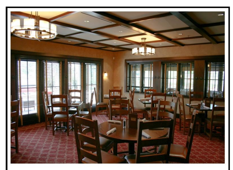
SOUTH DINING ROOM

Our most popular space for special events! Fully enclosed all-season for the most privacy. Well suited for intimate gatherings as well as large corporate functions, this space has it all!