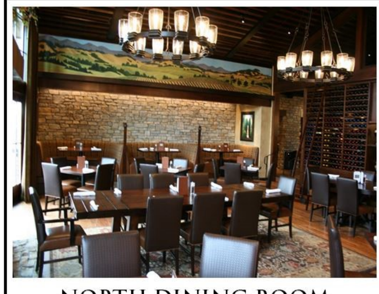
NORTH DINING ROOM

Newly enclosed with in-floor heat and a wood burning fireplace, this space also includes a full bar! Perfect for mingling social events! Also opens to The Porch to accommodate groups up to 100 guests. Fully-enclosed & private.