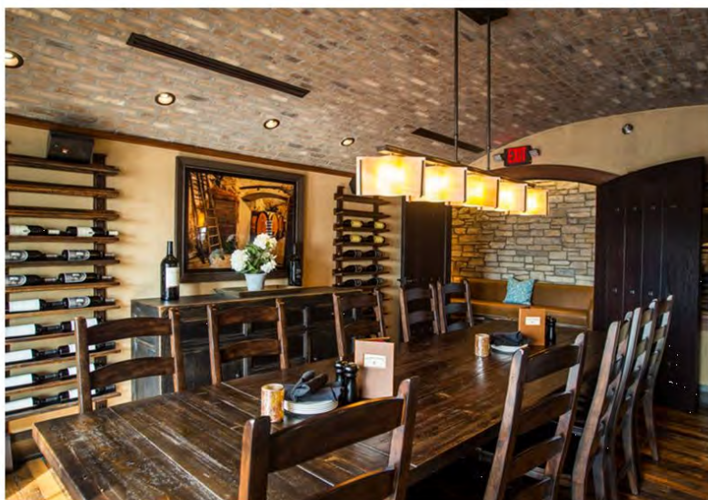
THE BARREL ROOM