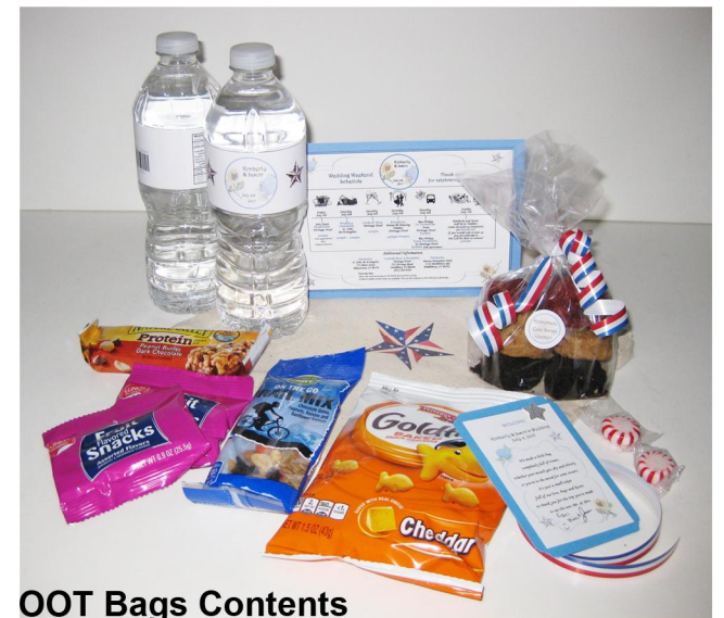
OOT Bags Contents