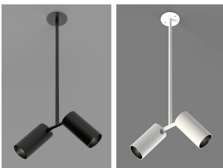
TubeSpot with Honeycomb Louvre

Available with filters, Glass Honeycomb louvres and slash nose tube perfect for finding the exact light and aesthetic required