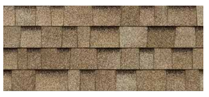
Amber<sup>†</sup> Not Available in Service Area 11 (see map).