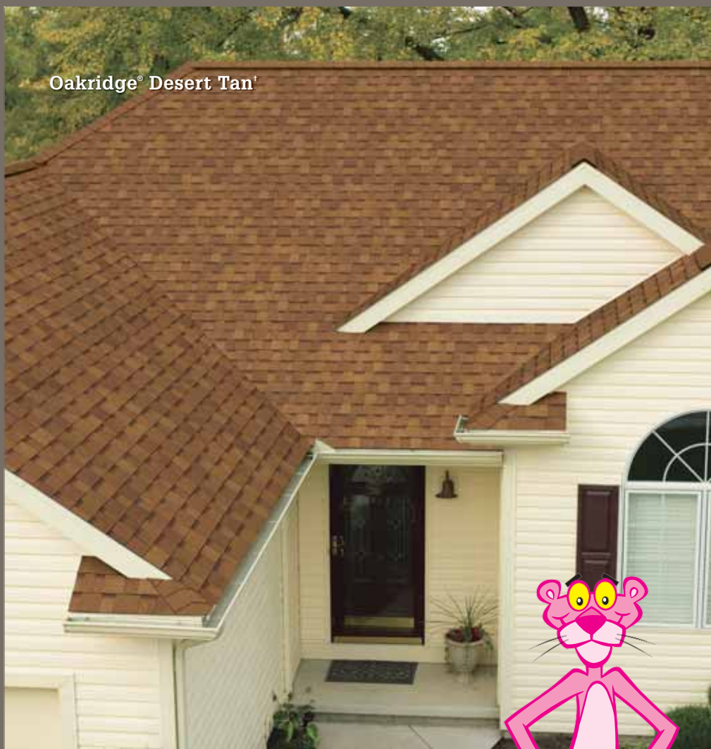
Oakridge® Desert Tan †