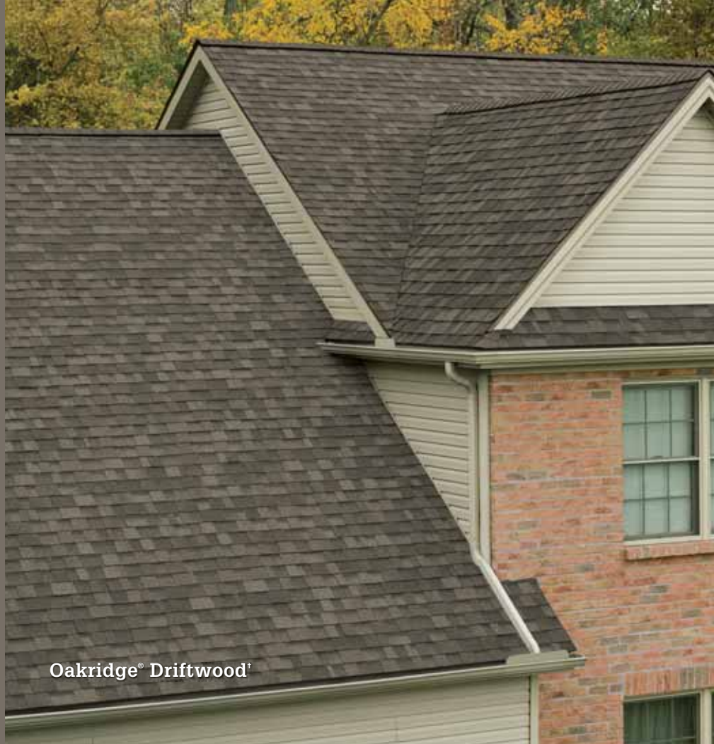
Oakridge® Driftwood †