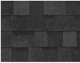
Onyx Black †