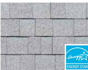
Shasta White †