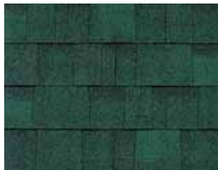
Chateau Green † Not Available in Service Area B (see map).