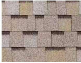
Beachwood Sand † Not Available in Service Area A (see map).