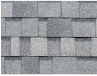
Antique Silver † Not Available in Service Area A (see map).