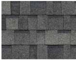
Estate Gray †