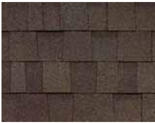
Teak † Not Available in Service Area B (see map).