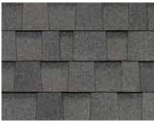
Williamsburg Gray † Not Available in Service Area B (see map).