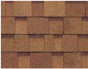
Desert Tan †