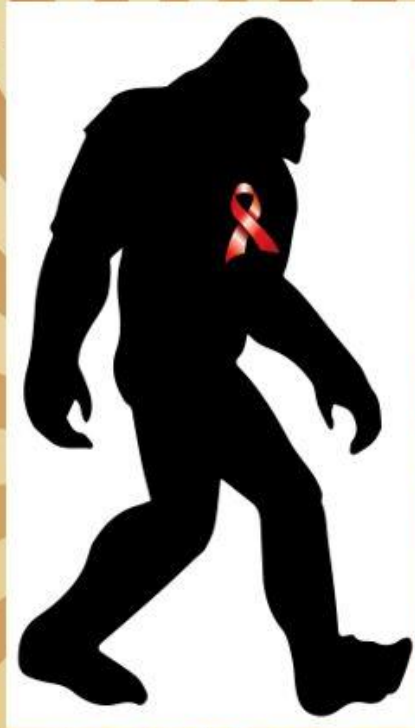
Elusive Red Ribbon Sasquatch