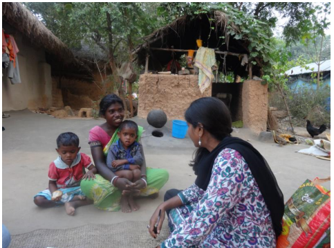
Social worker looks for TB patient and her children for prevention