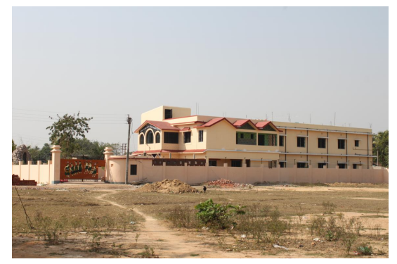
St. Mary's preventive Health Care Centre

c) Collaboration with St. Mary's Child and Mother Health Care Centre