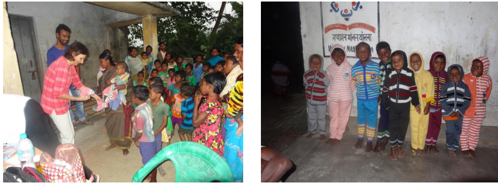
Children receive new cloths in the cold season

In November 2015 and January 2016 we have distributed new sweaters and pants for the children under 5 years in Bautijol and in Ringdanga.