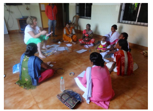
Training about pregnancy