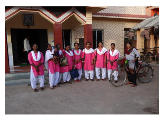
Health workers ready to go in the villages