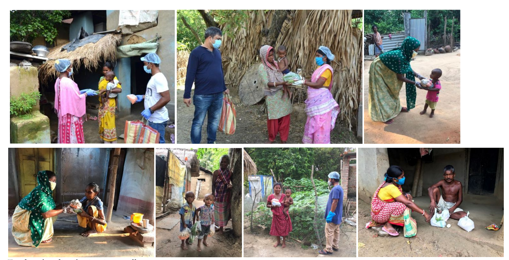
Food packet distribution in 12 villages