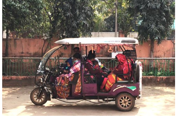
St. Mary's Child & Mother Health Care Centre

• Inpatient care (patient transport/ referral)