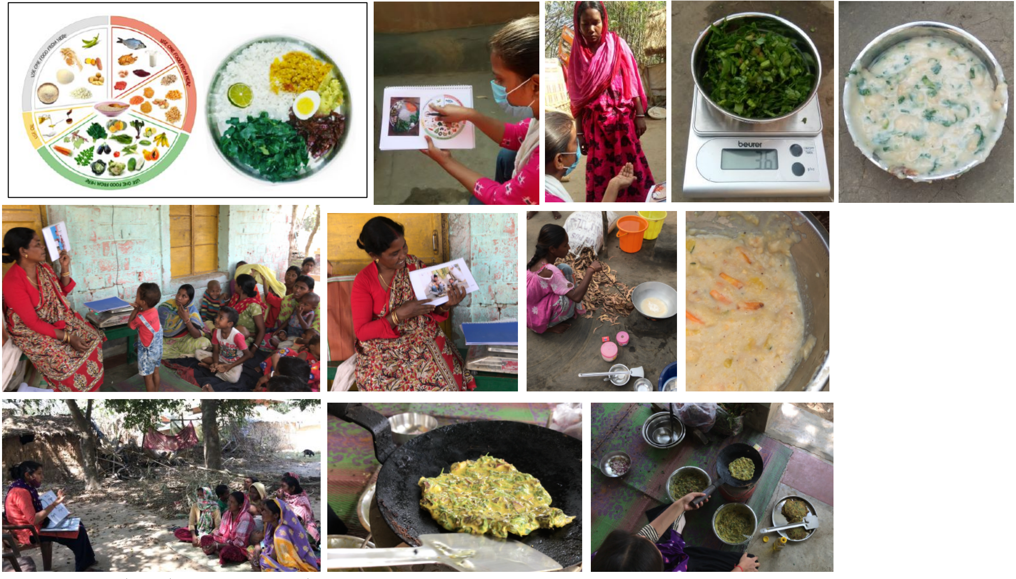
Community cooking demonstration and awareness training