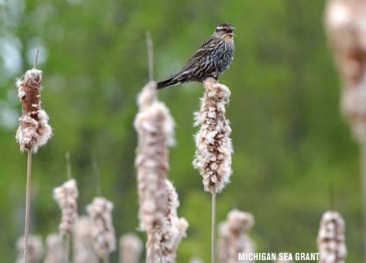
MICHIGAN SEA GRANT