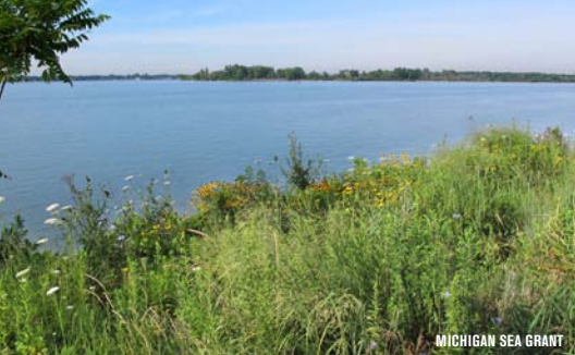
MICHIGAN SEA GRANT