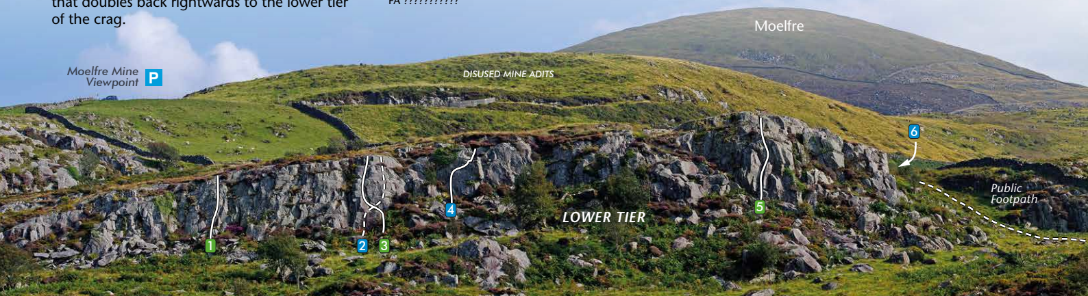
Moelfre Mine Viewpoint P