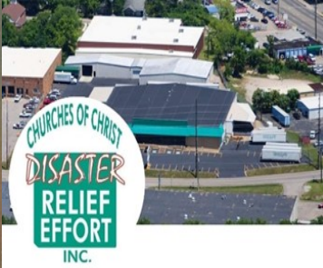
Churches of Christ Disaster Relief Inc.