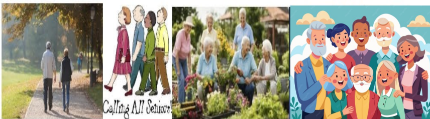
Calling All Seniors!