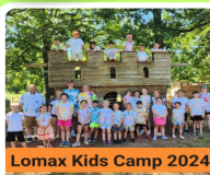
Lomax Kids Camp 2024