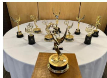
Film Award Statuettes for "Decoding" & "Mysteries"