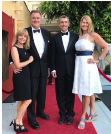
Los Angeles Independent Film Festival Awards 2019