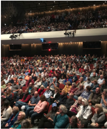
Audience for film premiere at Viterbo University 2018