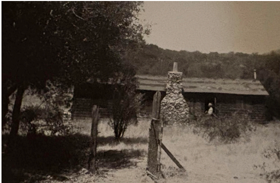
Brain house 1944

Gene Brain bought the house and 150 acres for $1,700 in 1942.