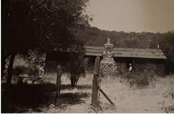
Brain house 1944

Gene Brain bought the house and 150 acres for $1,700 in 1942.