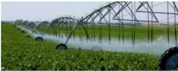
Agriculture Irrigation System