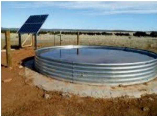
Livestock Solar Pump