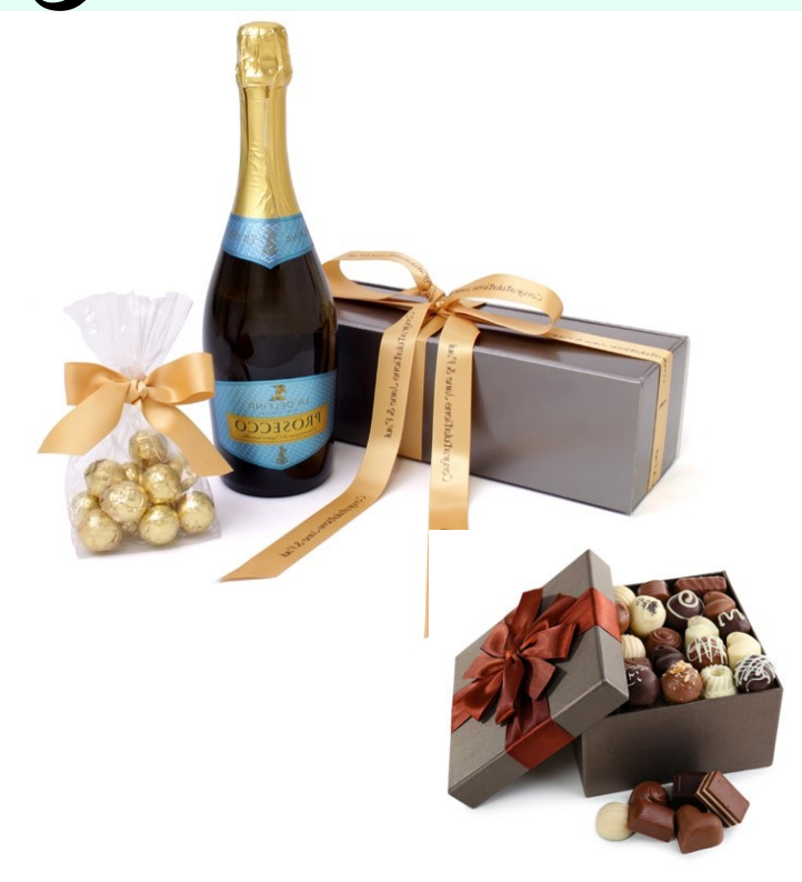
PROSECCO & LUXURY BELGIAN CHOCOLATES