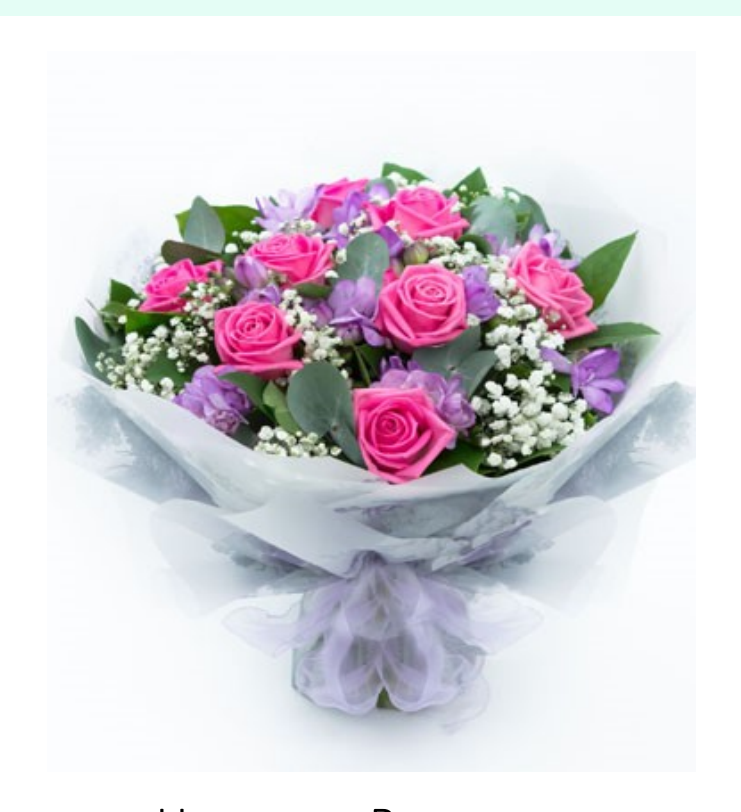
HANDTIED BOUQUET Seasonal Flowers & Roses