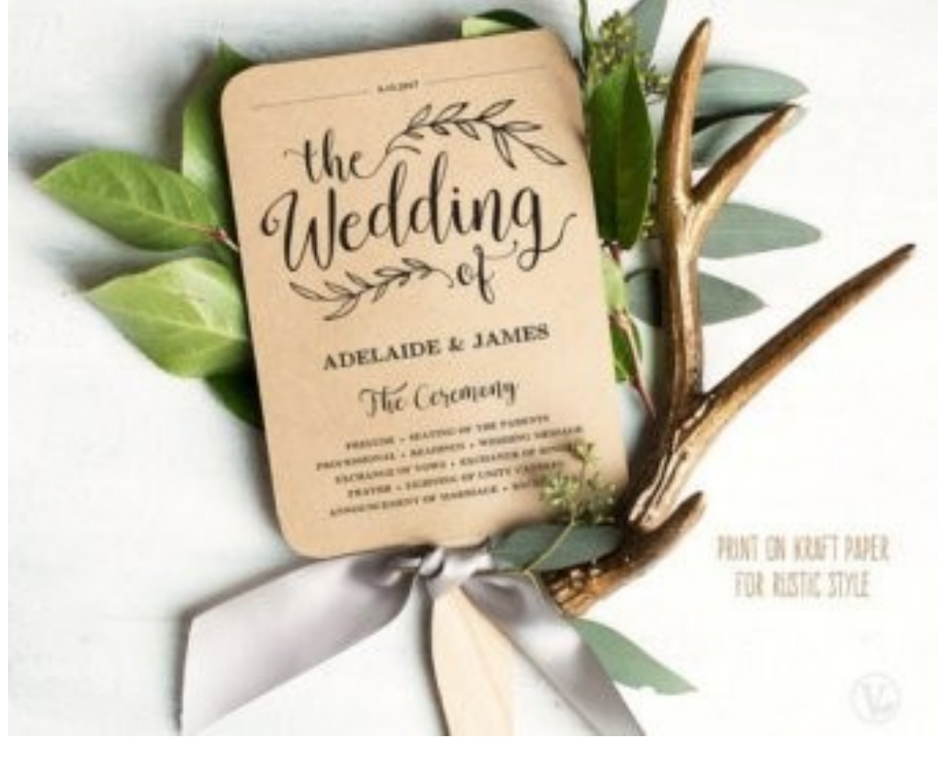
Personalised Wedding Fans Colour Coordinated to your Day