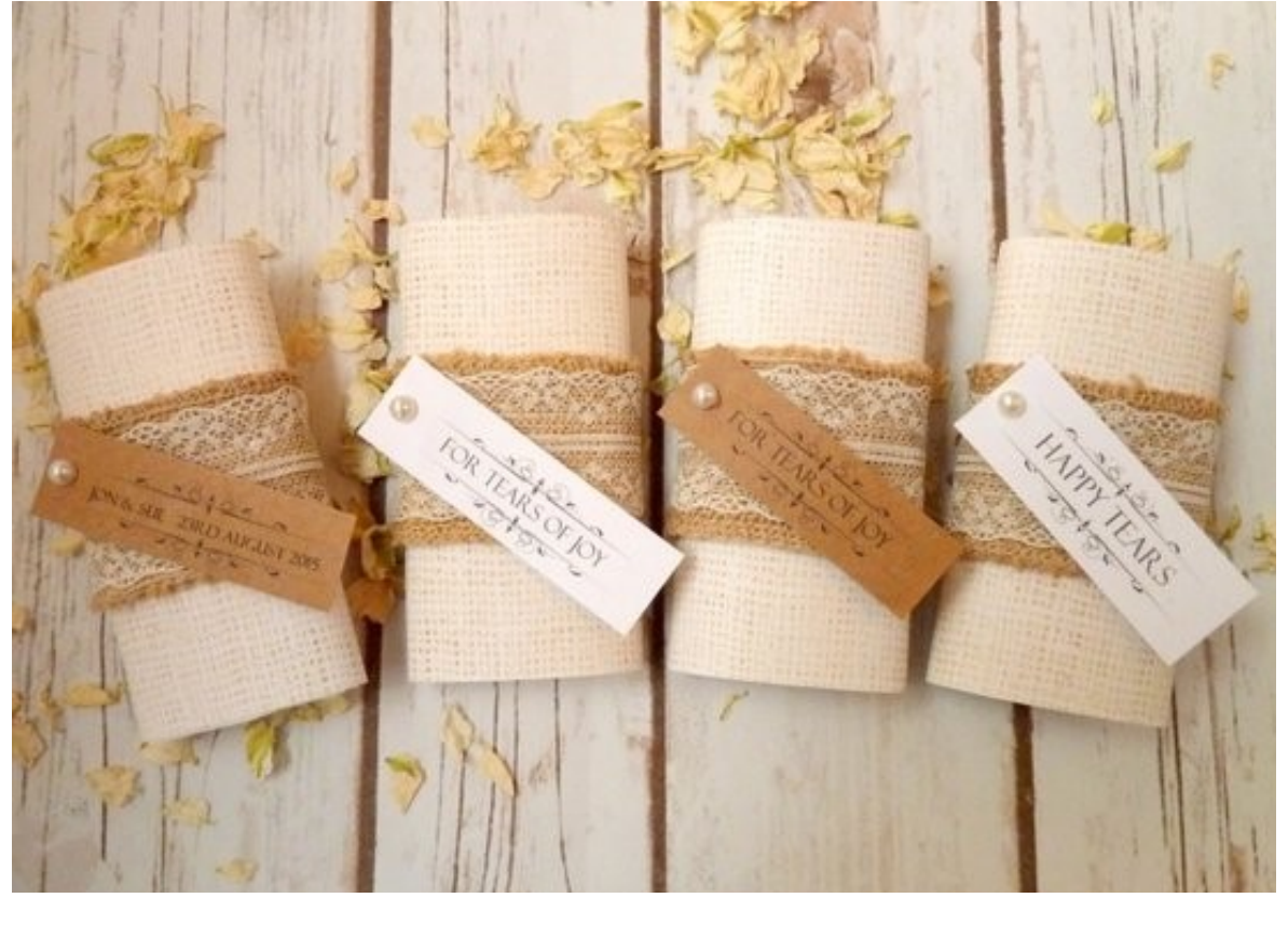
ORDER OF SERVICE CARDS COMPLETE WITH TISSUE INSERT OR MESSAGE