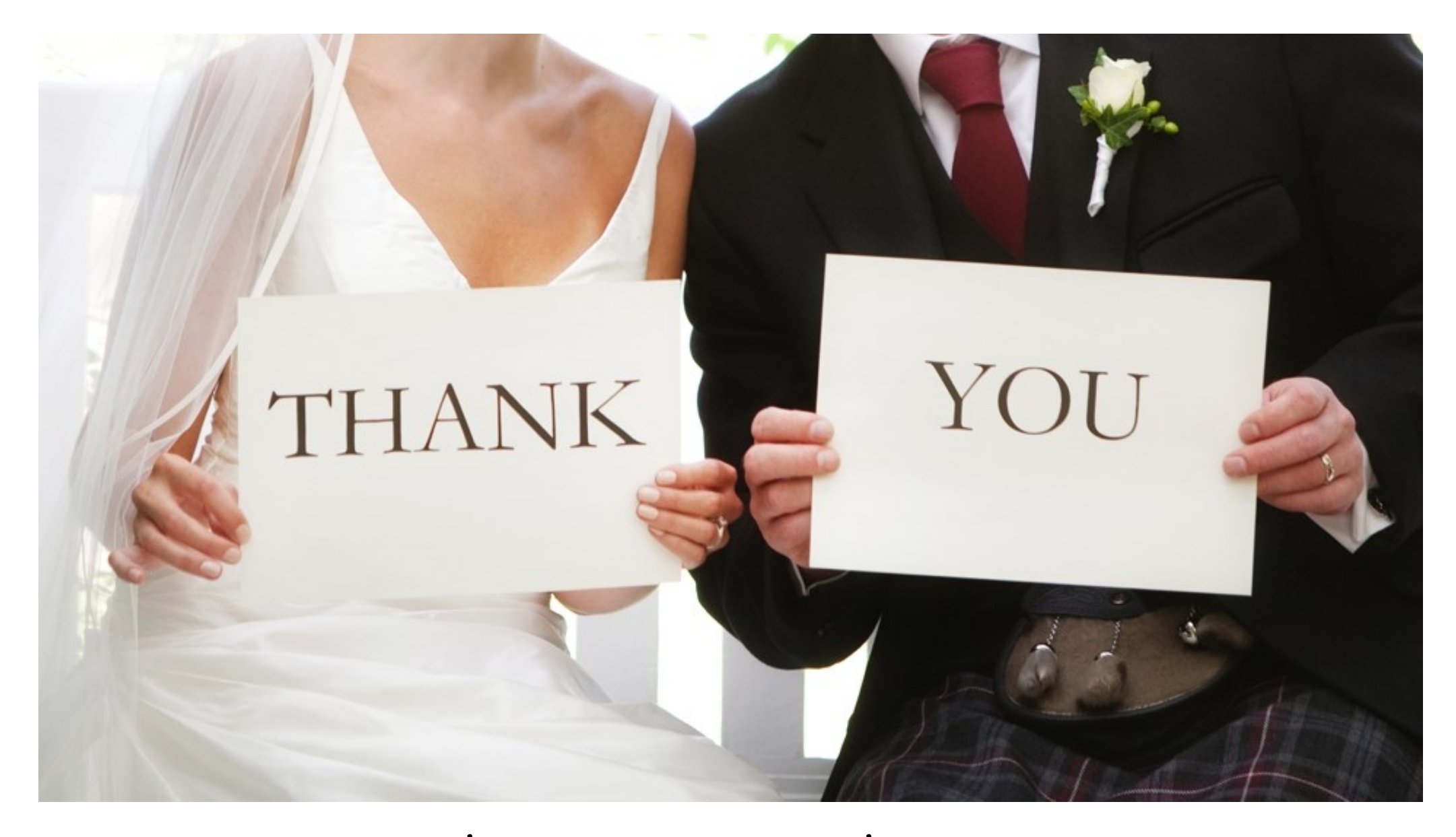
Gifts & Favours for Family & Guests