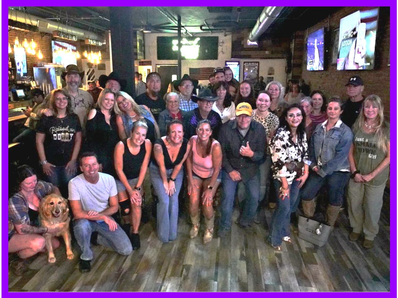
Boots were moving at last week's Cowboy Corner Reunion line dance night, hosted at Main Streety Honky Tonk in Saint Charles, MO.