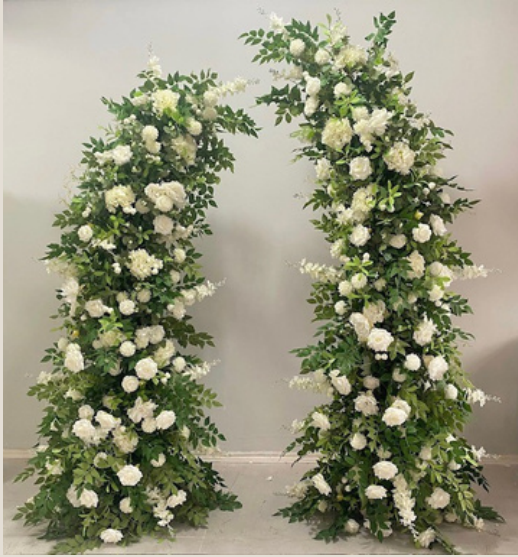
Floral Arches - £195 2.3m & 1.9m 1 set available