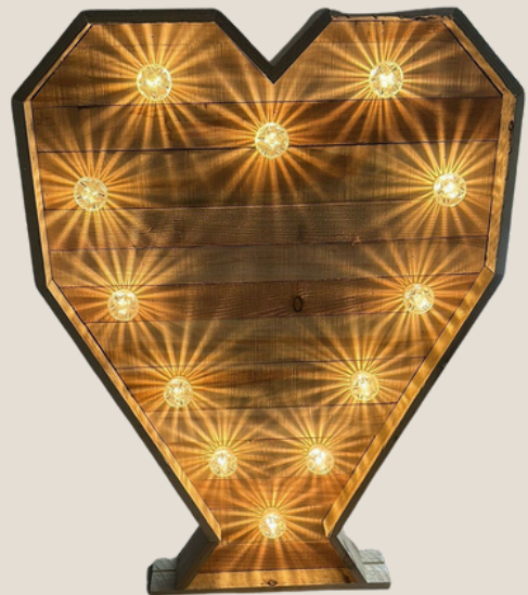
Rustic Heart - £80 4ft, mains powered, pat tested, 1 available