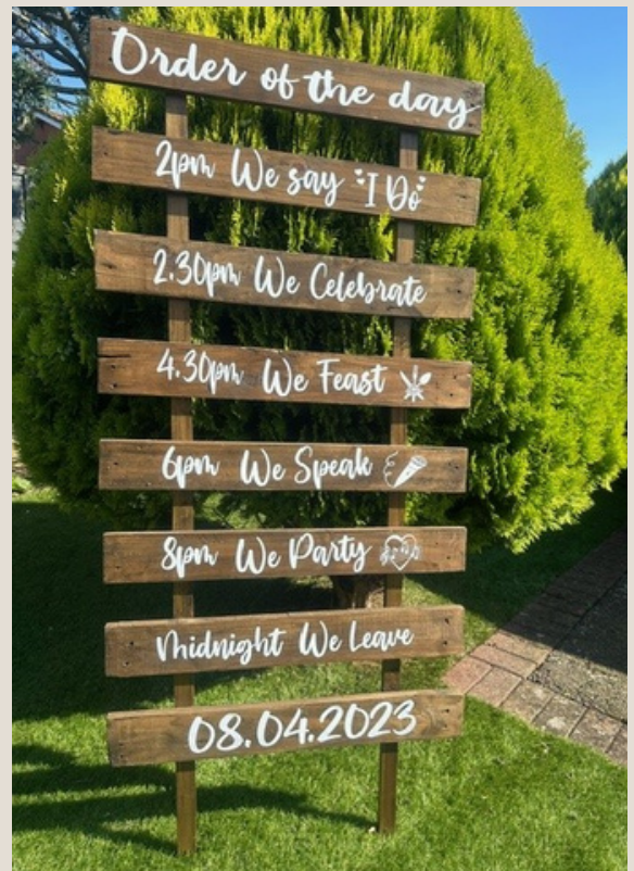
Ladder Order of the Day - £55 Wooden rustic ladder, fully personalised, 1 available