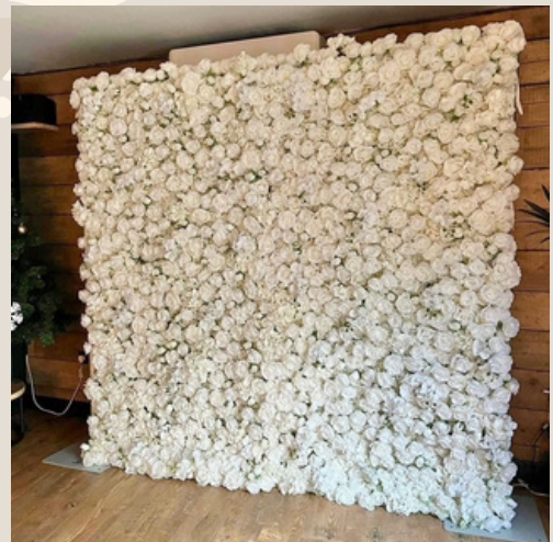
Flower Wall - £150 2.4m x 2.4m, 1 available