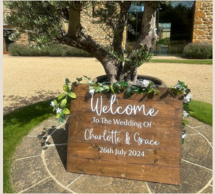
Rustic Welcome Sign - £45

available, large stained wooden pallet, comes with foliage & fully personalised