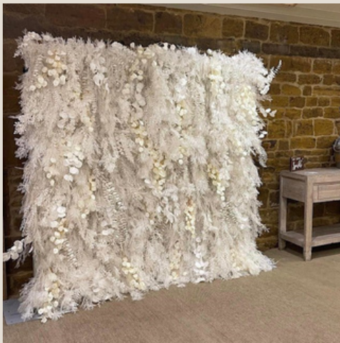
Pampas Wall - £150 2m x 2m, 1 available