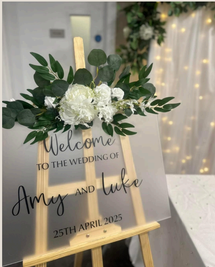
Frosted Acrylic Sign - £45 A2, foliage included, 1 available