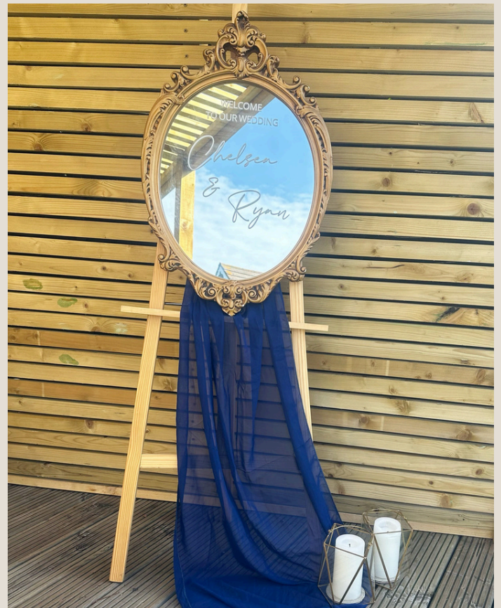
Gold Welcome Mirror - £50 draping fabric in a colour of your choice, 1 available