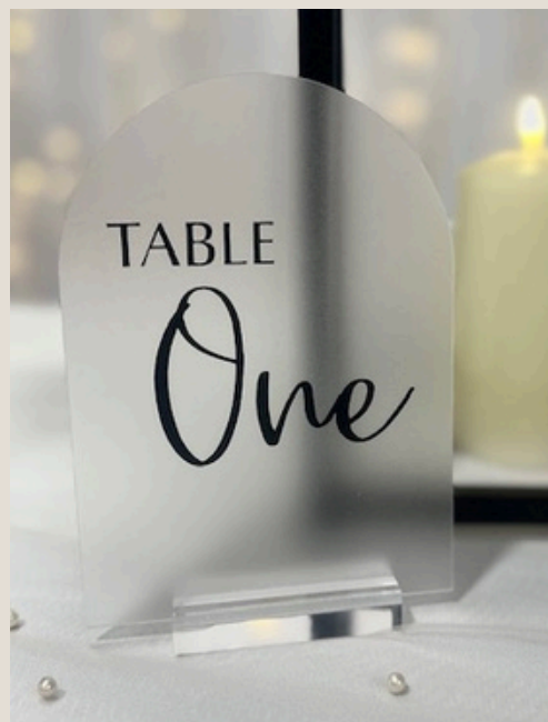
Frosted Acrylic 10 available