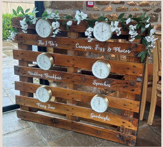
Rustic Order of the Day Pallet - £55 includes the clocks & foliage, 1 available