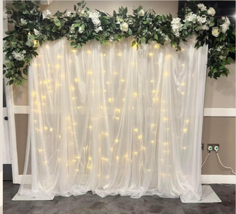
Fairy Light Backdrop - £150 2.4m x 2m, battery powered, 1 available