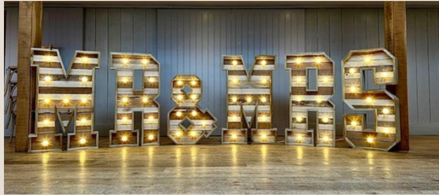
Mr & Mrs Letters - £175 4ft, mains powered, pat tested, 1 set available