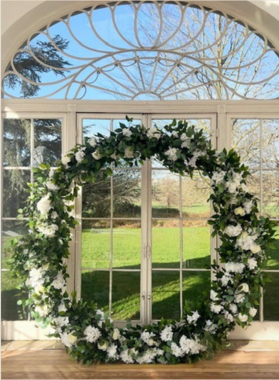
Foliage Moongate - £165 2m x 2m, artificial foliage, 1 available