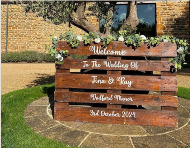
Welcome Pallet - £50

available, large stained wooden pallet, comes with foliage & fully personalised