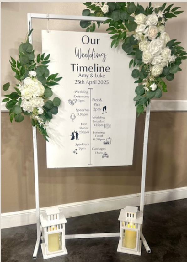
Timeline Order of the Day - £85 Fully personalised, A1 size,