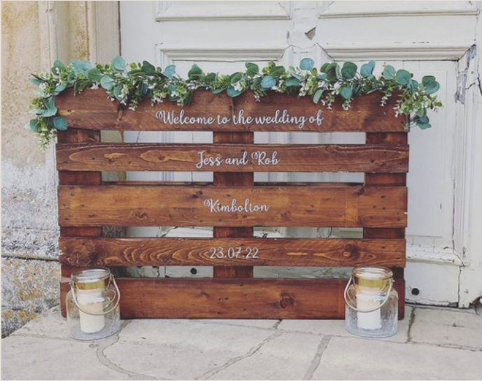
Welcome Pallet - £50

available, large stained wooden pallet, comes with foliage & fully personalised