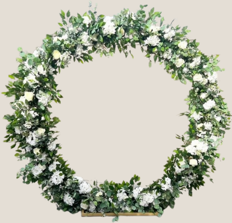
Foliage Moongate - £165

2m x 2m, artificial foliage, neon sign is optional extra, 1 available