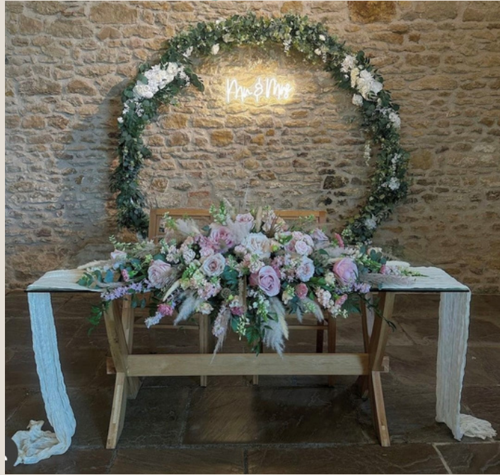
Mr & Mrs

warm white, 56cms x 21cms, mains powered, pat tested, 2 available