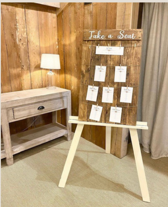
Table Plan - £45

fits up to 12 a6 cards & top table, cards not included, easel not included, 2 available