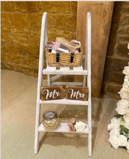
Small Ladder - £25 100cms, 1 available