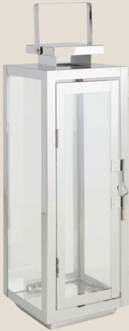
Silver Lantern 31cms, 10 available