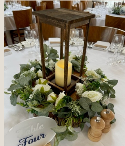
Wooden Lantern 30cms, 15 available