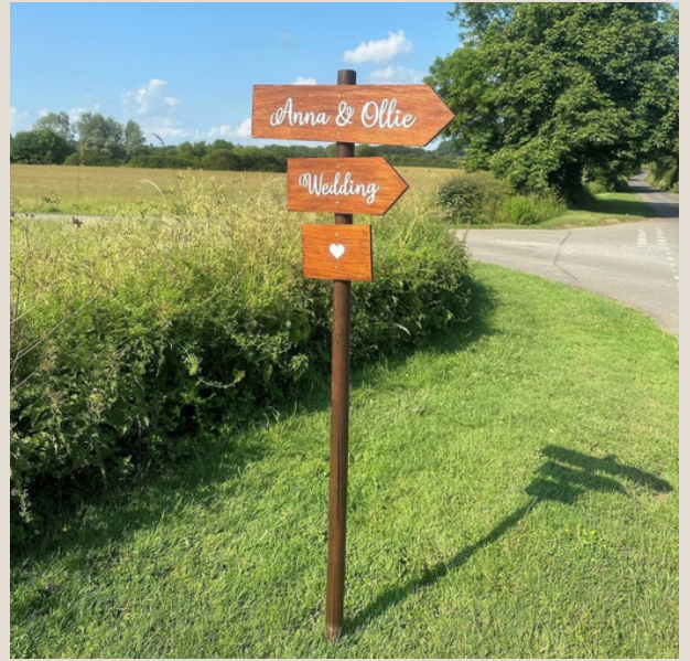
Arrow Signs -£45 each

2m x 1.5m, comes with flower swags, can be decorated yourself or have our neon signs hung from them. 1 available