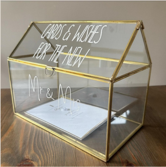
Gold Glass Postbox - £30 26cms x 15cms, 1 available