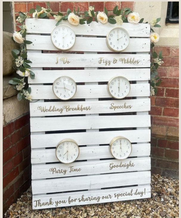
Order of the Day - £55

fits up to 12 a6 cards & top table, cards not included, easel not included, 2 available