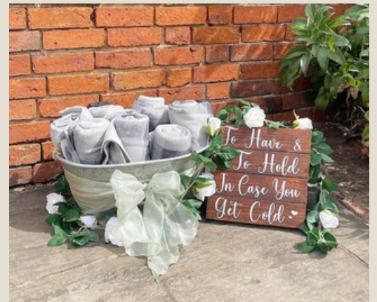
Blanket Box - £40 10 blankets, 1 available, includes sign