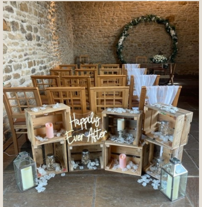
Wooden Apple Crates

2 large & 2 small available, large 28cms, small 18cms