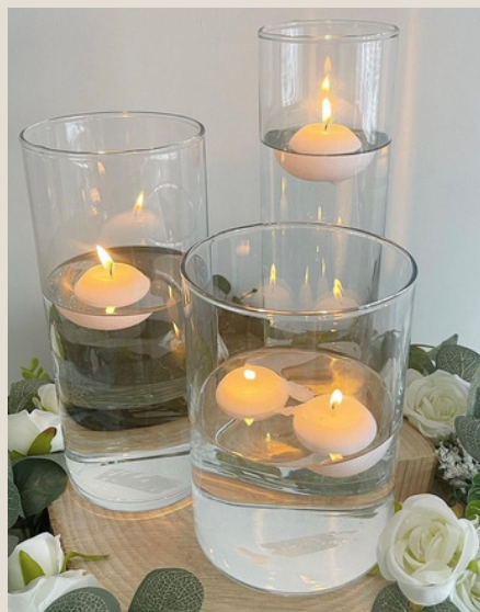
Large Glass Vases set of 3, 15 sets available, tallest is 31cms