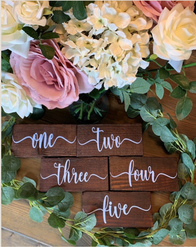
Table Numbers £5 each