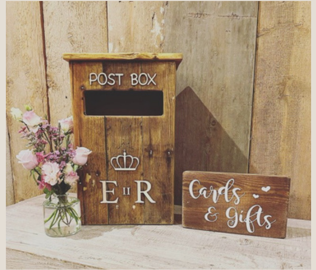
Rustic Post Box (Standard) - £35 60cms x 25cms, 1 available