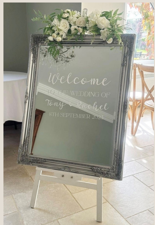
Welcome Mirror - £50

A2, includes foliage & comes fully personalised, 2 available