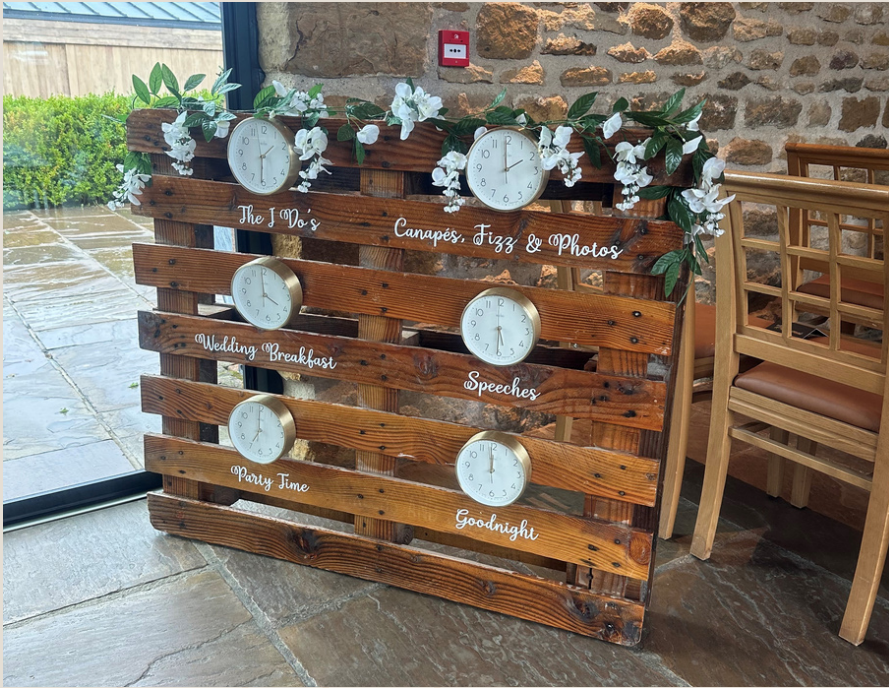
Rustic Order of the Day Pallet - £55 includes the clocks & foliage, 1 available