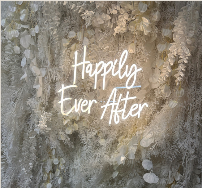
Happily Ever After

warm white, 56cms x 21cms, mains powered, pat tested, 2 available