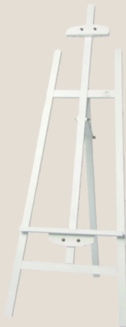
Easel - £20 155cms x 50cms, 2 available in white, 1 available in wood