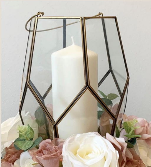
Geo Lantern 18cms, 7 available