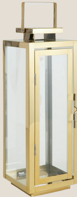
Gold Lantern 31cms, 10 available