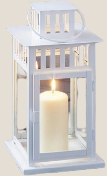
White Lantern 28cms, 10 available