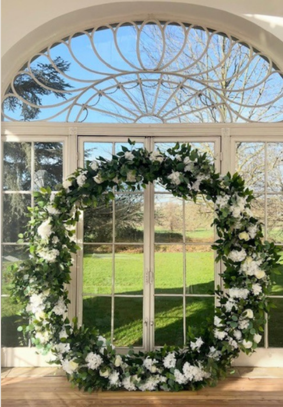
Foliage Moongate -£165

2m x 2m, artificial foliage, neon sign is optional extra, 1 available