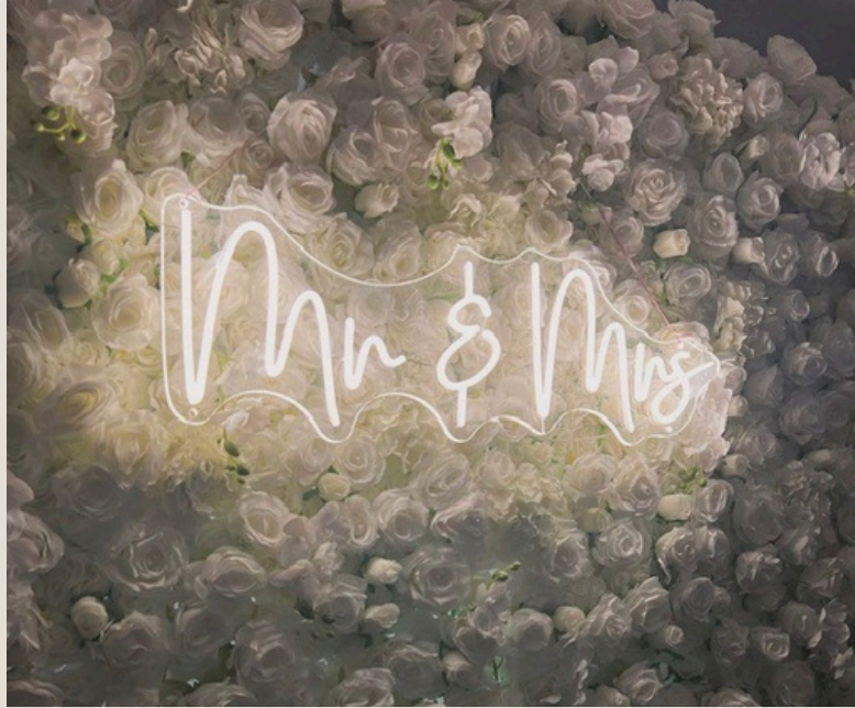
Mr & Mrs

warm white, 56cms x 21cms, mains powered, pat tested, 2 available