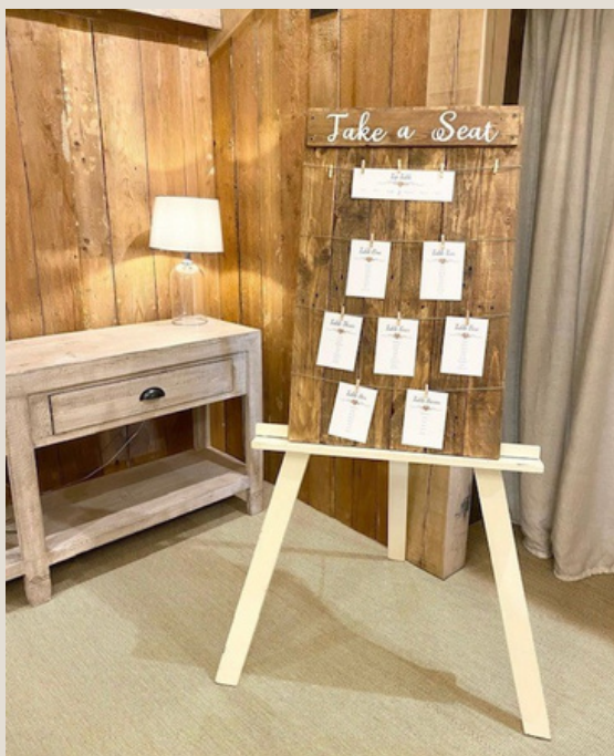
Table Plan - £45

fits up to 12 a6 cards & top table, cards not included, easel not included, 2 available