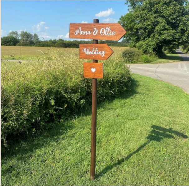
Arrow Signs - £45 each 1.5m, comes personalised, 3 available