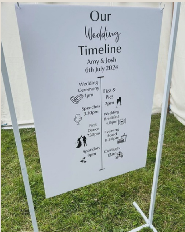
Timeline Order of the Day - £85 Fully personalised, A1 size,