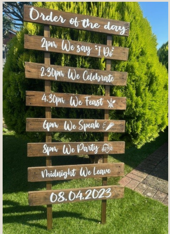
Ladder Order of the Day - £55 Wooden rustic ladder, fully personalised, 1 available