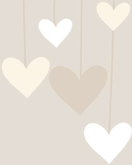
Gold Welcome Mirror - £50 Comes with either white or wooden easel and draping fabric in a colour of your choice, 1 available