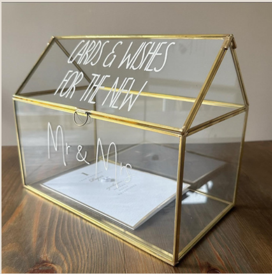
Gold Glass Postbox - £30 26cms x 15cms, 1 available