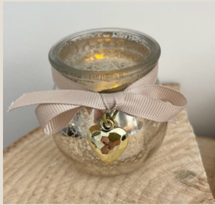
Mini Champagne Tea Light Holder £2.50