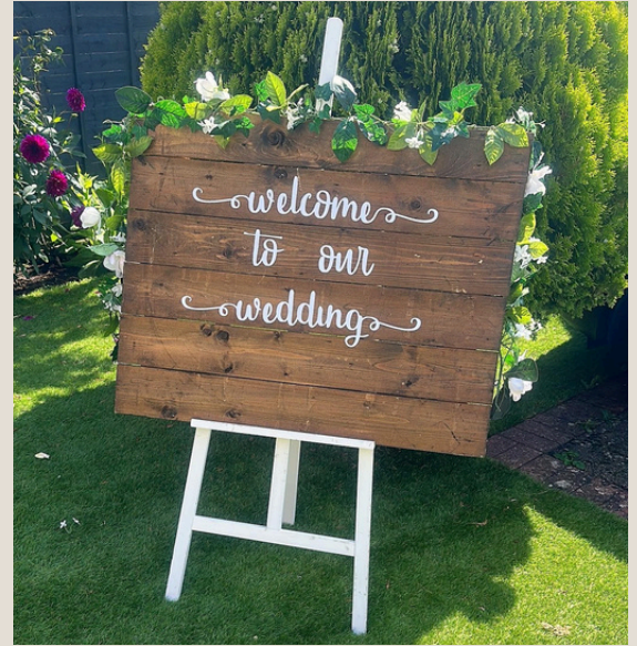
Rustic Welcome Sign - £45

available, large stained wooden pallet, comes with foliage & fully personalised