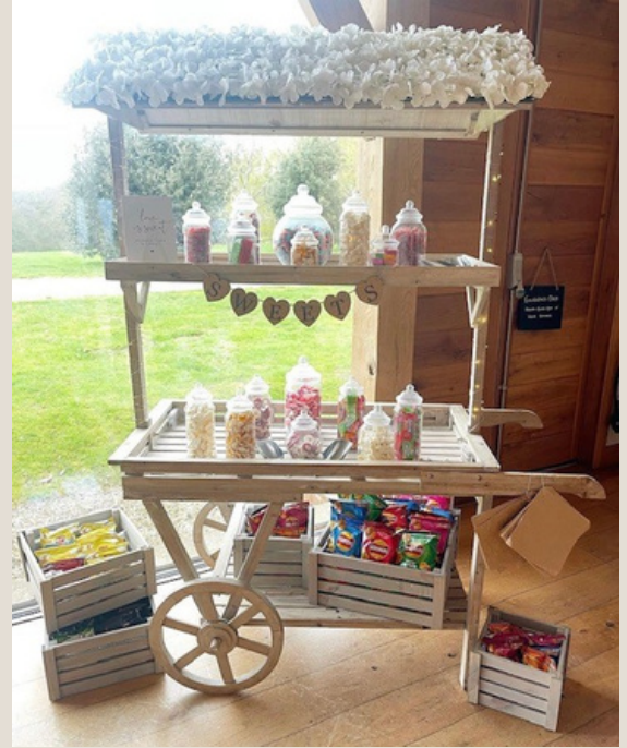
Rustic Sweet Cart - £85

1 available, battery powered fairy lights, artificial flower roof, includes jars (30 available), tongs, scoops & 100 bags