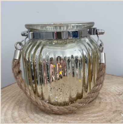
Champagne Glass Lantern £3