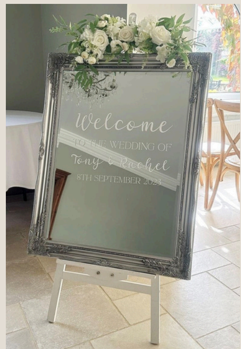
Welcome Mirror - £50

A2, includes foliage & comes fully personalised, 2 available