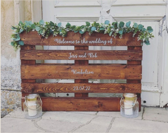
Welcome Pallet - £50

available, large stained wooden pallet, comes with foliage & fully personalised