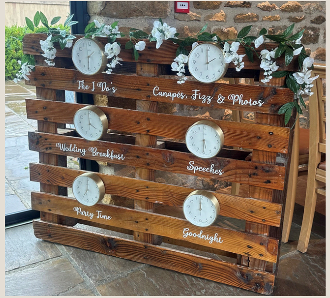
Rustic Order of the Day Pallet - £55 includes the clocks & foliage, 1 available