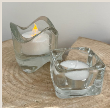
Glass Tealight Holders £2