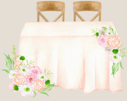
Table Runners £10 each