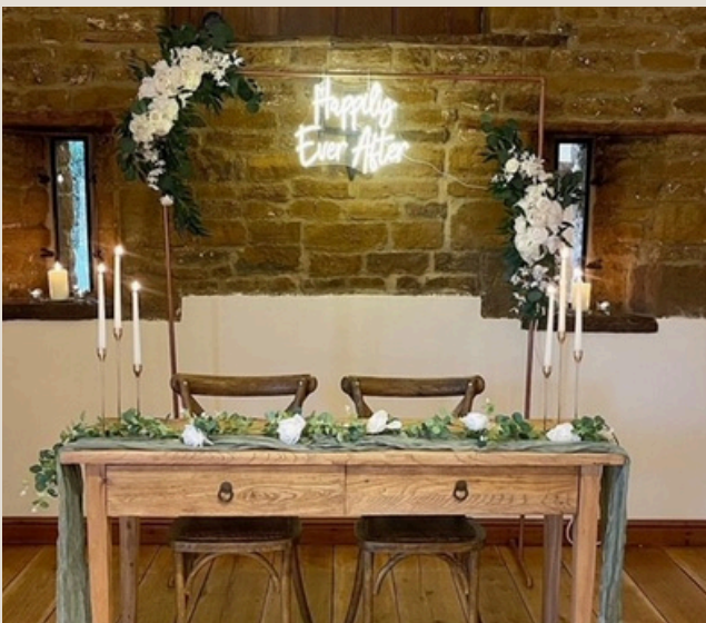
Copper Frame - £75

1 available, battery powered fairy lights, artificial flower roof, includes jars (30 available), tongs, scoops & 100 bags