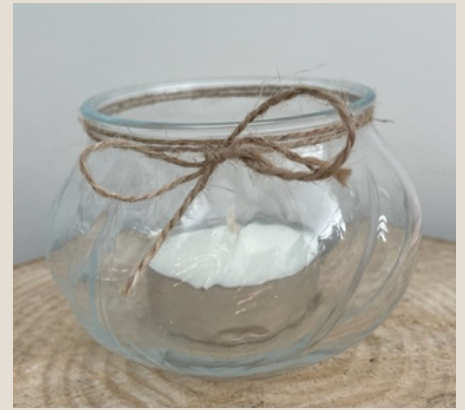
Glass Bowl Tealight/Vase £2.50 10 available