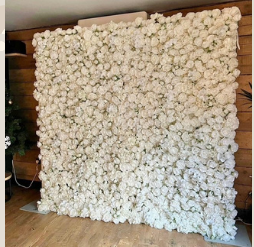
Flower Wall - £150 2.4m x 2.4m, 1 available