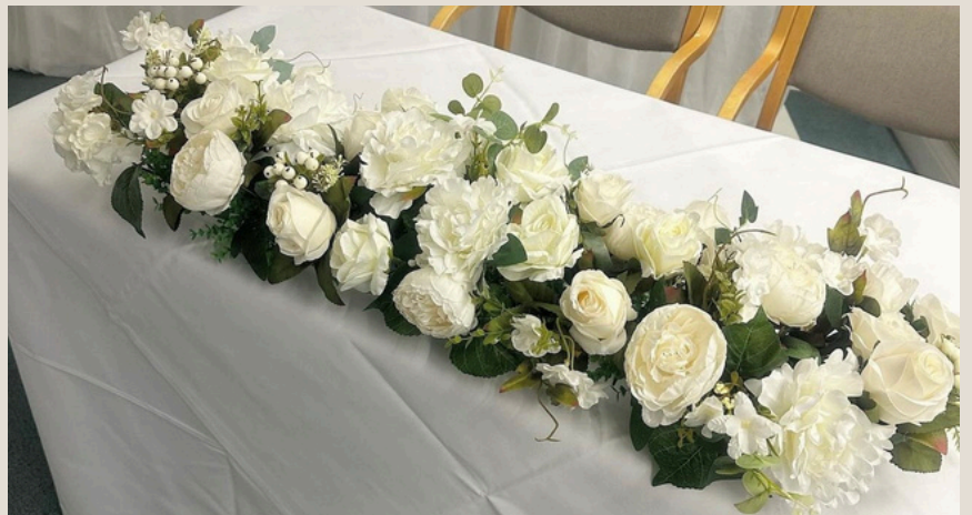
Top Table Spray - £20 1 metre long, artificial flowers