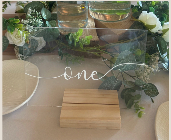
Clear Acrylic 12 available