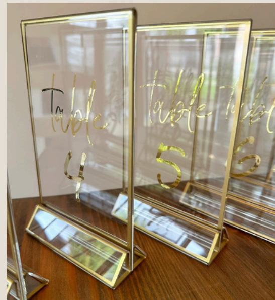
Clear Gold Frames gold foil writing, 10 available