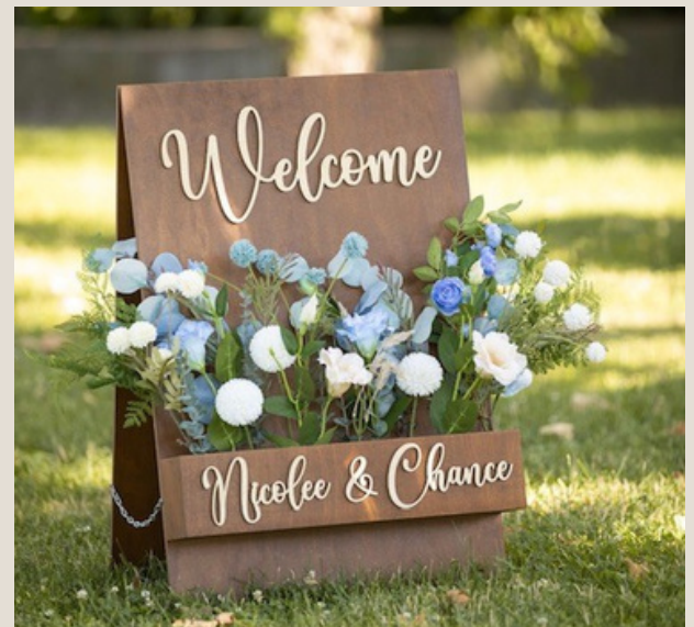
A Frame Sign- £80

2m x 1.5m, comes with flower swags, can be decorated yourself or have our neon signs hung from them. 1 available