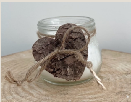
Rustic Heart Candle £2