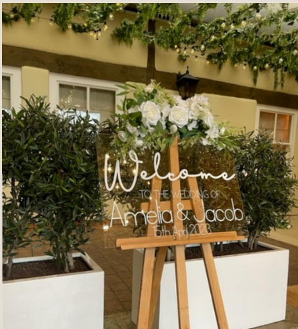
Acrylic Welcome Sign - £45

1 available, solid wooden sign, comes with foliage & fully personalised