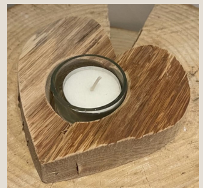
Heart Tealight Holder £2