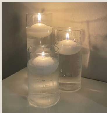
Mini Glass Vases £10 per set