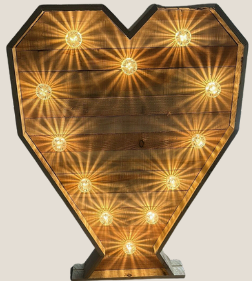
Rustic Heart - £80 4ft, mains powered, pat tested, 1 available