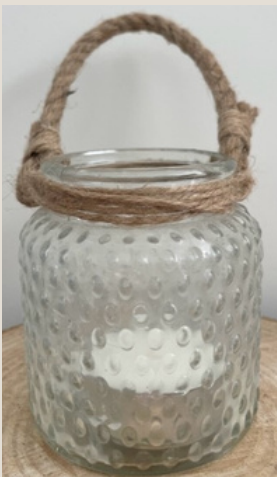
Glass Lantern £3