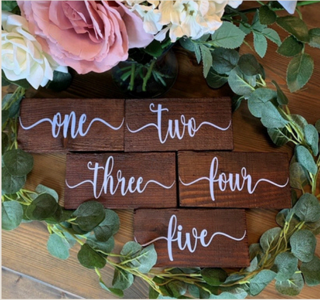
Wooden Blocks, 10 available