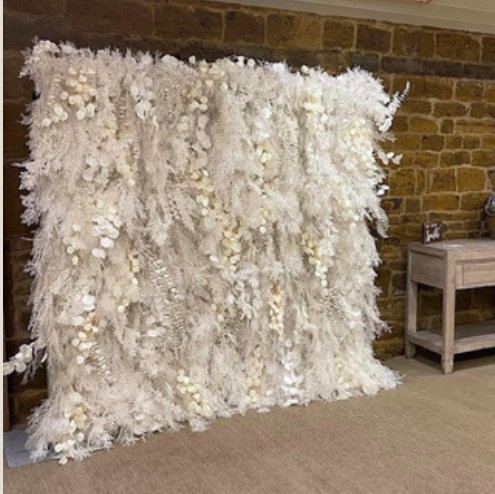
Pampas Wall - £150 2m x 2m, 1 available