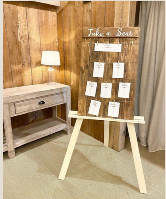
Table Plan - £45 fits up to 12 a6 cards & top table, cards not included, easel not included, 2 available