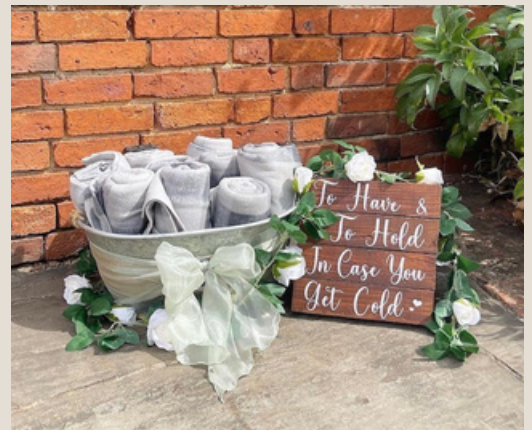
Blanket Box - £40 10 blankets, 1 available, includes sign