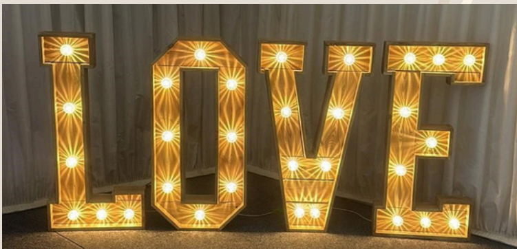
Love Letters - £125 4ft, mains powered, pat tested, 1 set available