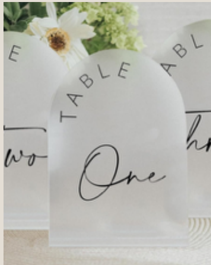
Frosted Acrylic 10 available