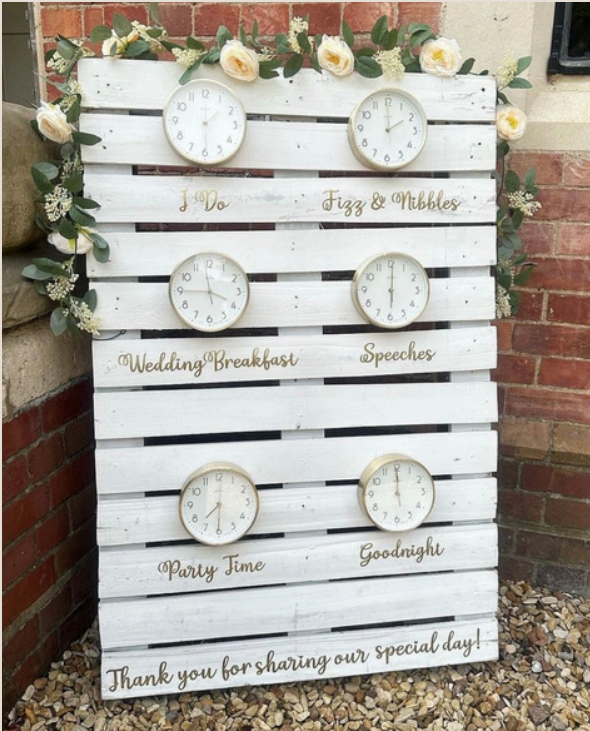
White Order of the Day - £55 includes clocks & foliage, 1 available