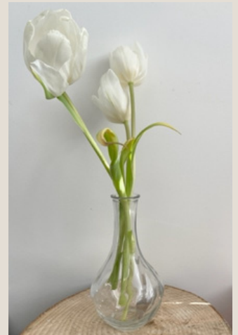
Glass Vase £3