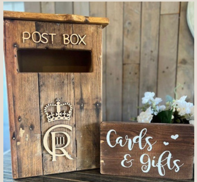
Rustic Post Box - £35 60cms x 25cms, 1 available