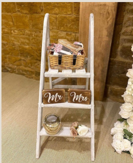
Small Ladder - £25 100cms, 1 available