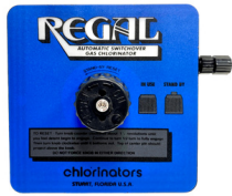
Models 216/226/256 Automatic Switchover

The REGAL™ Gas Chlorinator is used to chlorinate water, wastewater, and industrial process water with gas chlorine. The simple, efficient design has made REGAL™ Gas Chlorinators the industry standard. Built with heavy-duty corrosion-resistant parts, REGAL™ Chlorinators provide safe, long-lasting service.