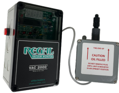
Vac 2000 Vacuum Monitor

The REGAL™ Series 3000 Gas Detectors are designed to accurately sense the presence of chlorine and/or sulfur dioxide in an enclosed environment. The REGAL™ detectors are available in both single and dual-sensor models.