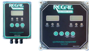
Models 401/402 Electronic Scales

The REGAL VAC 2000 is a 100% electronic, full-featured vacuum monitoring system utilizing the latest in integrated sensor technology for improved accuracy, reliability, and versatility. The system allows direct contact with many liquids and gases, including chlorine.