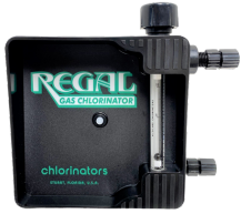
Models 210/220/250 Gas Chlorinator

The REGAL™ Gas Chlorinator is used to chlorinate water, wastewater, and industrial process water with gas chlorine. The simple, efficient design has made REGAL™ Gas Chlorinators the industry standard. Built with heavy-duty corrosion-resistant parts, REGAL™ Chlorinators provide safe, long-lasting service.