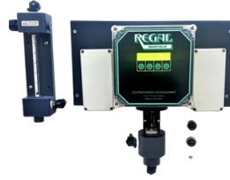
Series 7000 Smartvalve

The REGAL™ Automatic Switchover Gas Chlorinator is a totally vacuum-operated system that is designed to automatically switch the chlorine feed from an empty cylinder to a full cylinder. It is also designed to provide system backup. Should a problem develop with either vacuum regulator, chlorination can be continued.