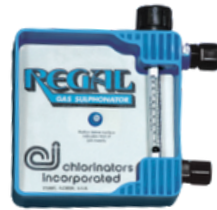
Models 710/720/750 Sulphonator

REGAL™ Series ECS Electronic Cylinder Scales are very important and recommended accessories that should be part of all REGAL™ Gas Feed System installations.