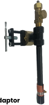
Tay-200 Ton Adaptor

The REGAL™ Gas Sulphonator is used to de-chlorinate water, wastewater, and industrial process water with sulfur dioxide. REGAL™ Sulphonators are based on the same simple, efficient design that has made REGAL™ Gas Chlorinators the industry standard. Built with heavy-duty corrosion-resistant parts, REGAL™ Sulphonators provide safe, long-lasting service.