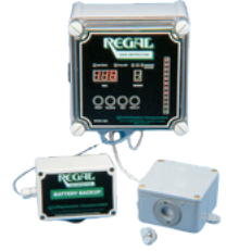
Series 3000 Gas Detector

The REGAL™ SMARTVALVE is designed to automatically regulate the gas feed rate needed to maintain the chemical residual level determined for a specific water treatment application. Different models are available to be used for chlorine or sulfur dioxide applications.