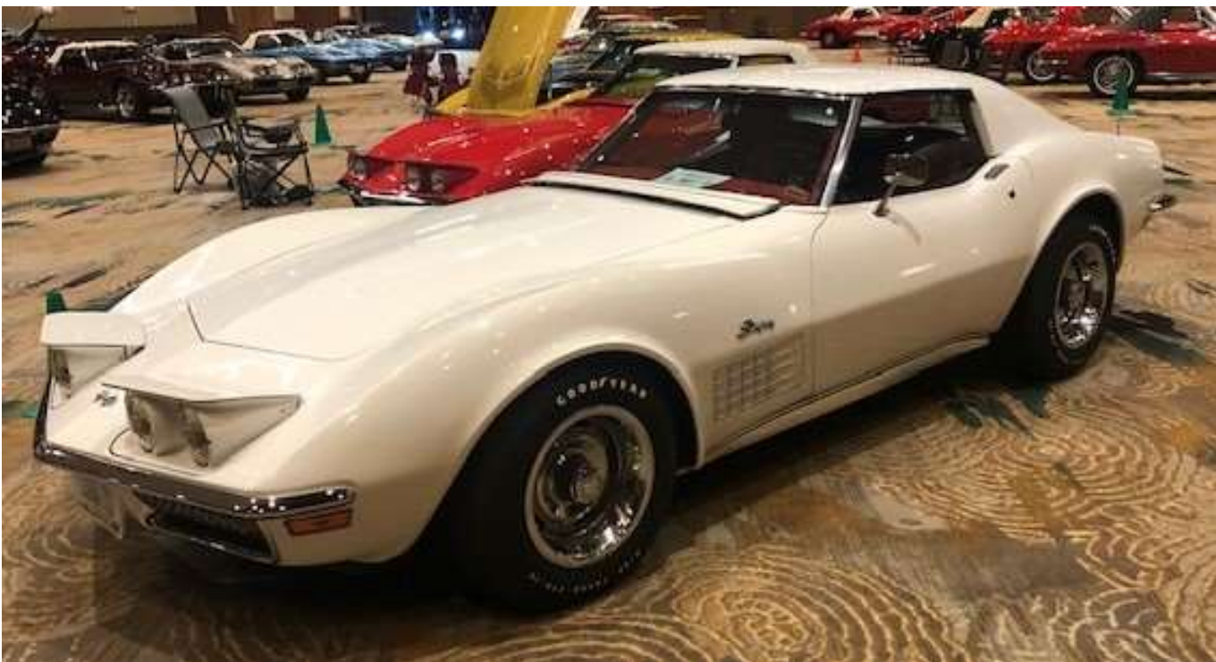
Steve Kessler's 1972 Top Flight