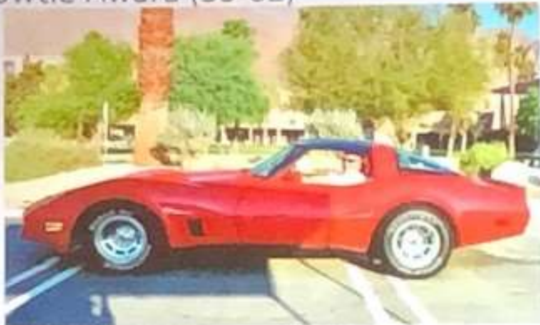
Bowtie Award (53-82)