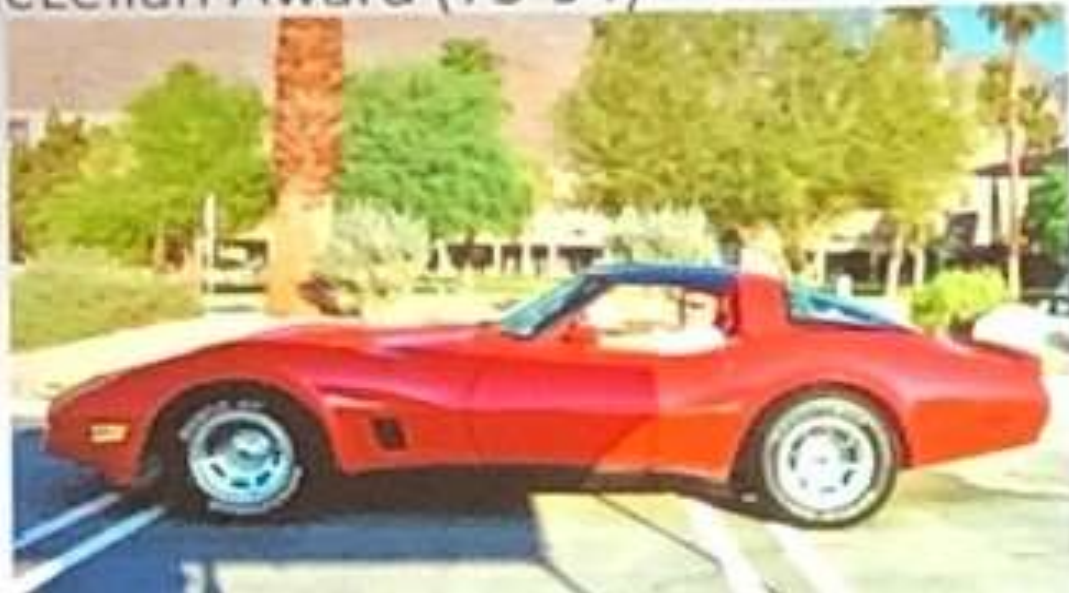
McLellan Award (75-94)