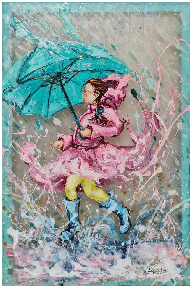
SKIES FULL OF PROMISE, 2025 23.5 x 16 inches (60 x 40 inches) Acrylic on jusi fabric