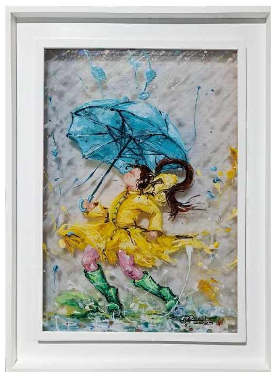
OVERFLOWING JOY, 2025