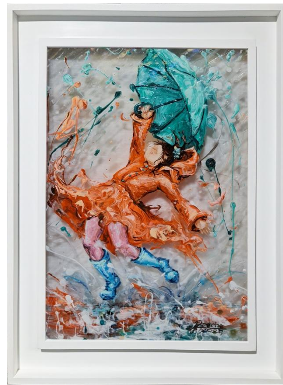
RAIN DANCE, 2025 Acrylic on acrypoly, 18 x 12 inches