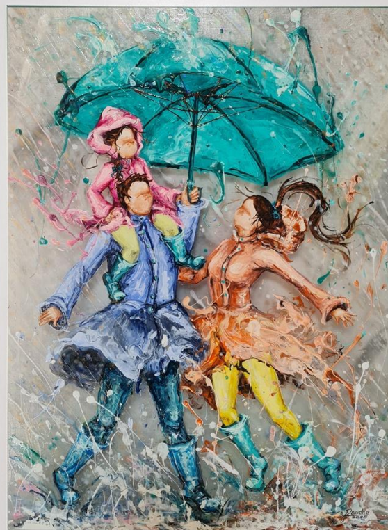
SHOWER WITH LOVE, 2025