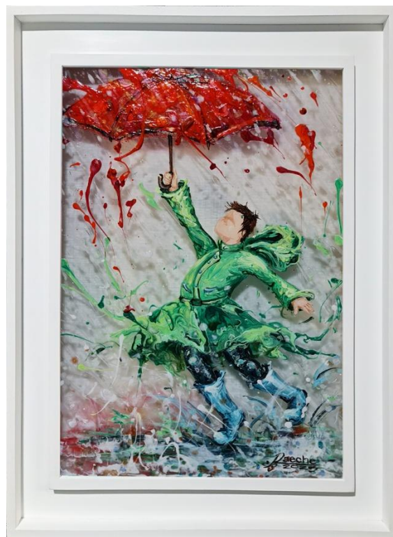
WHEN RAINDROPS FALL, 2025 Acrylic on acrypoly, 18 x 12 inches