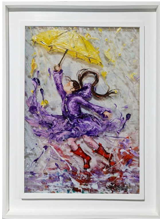
GRATEFUL SKIES, 2025