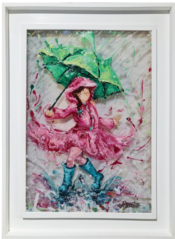
THE SKY SMILED TODAY, 2025 Acrylic on acrypoly, 18 x 12 inches