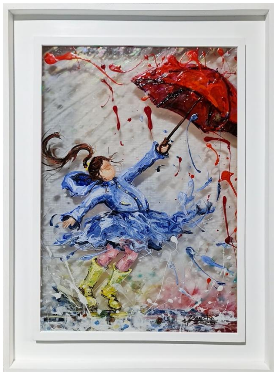
WHEN RAIN BECOMES MAGIC, 2025