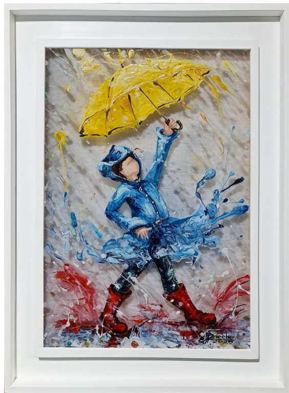
THE JOY WE FOUND, 2025 Acrylic on acrypoly, 18 x 12 inches