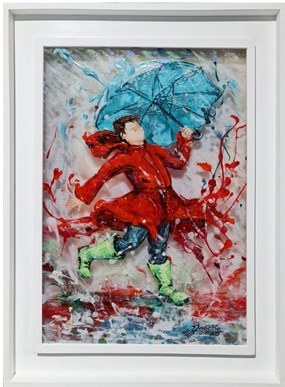
SOUND OF RAIN, 2025