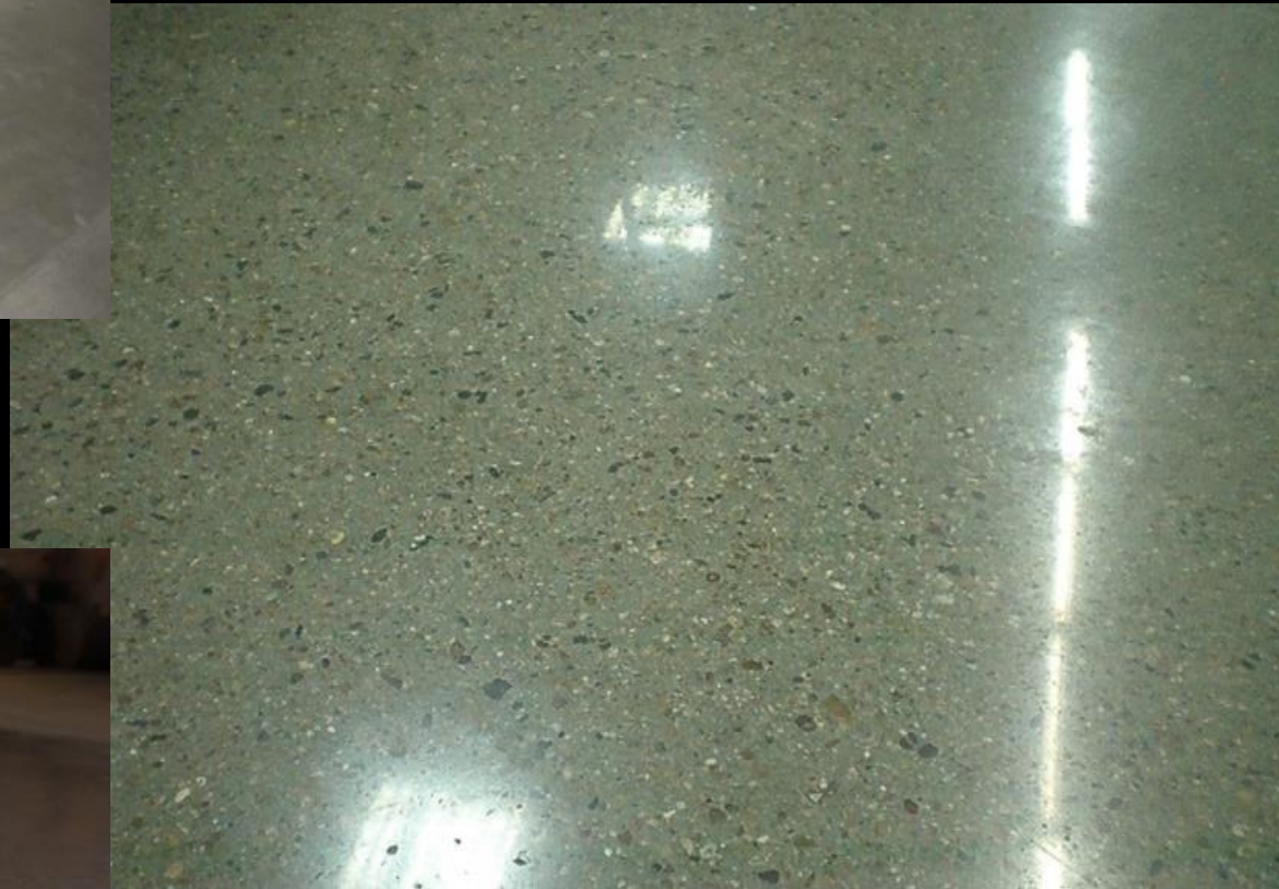
Salt and Pepper