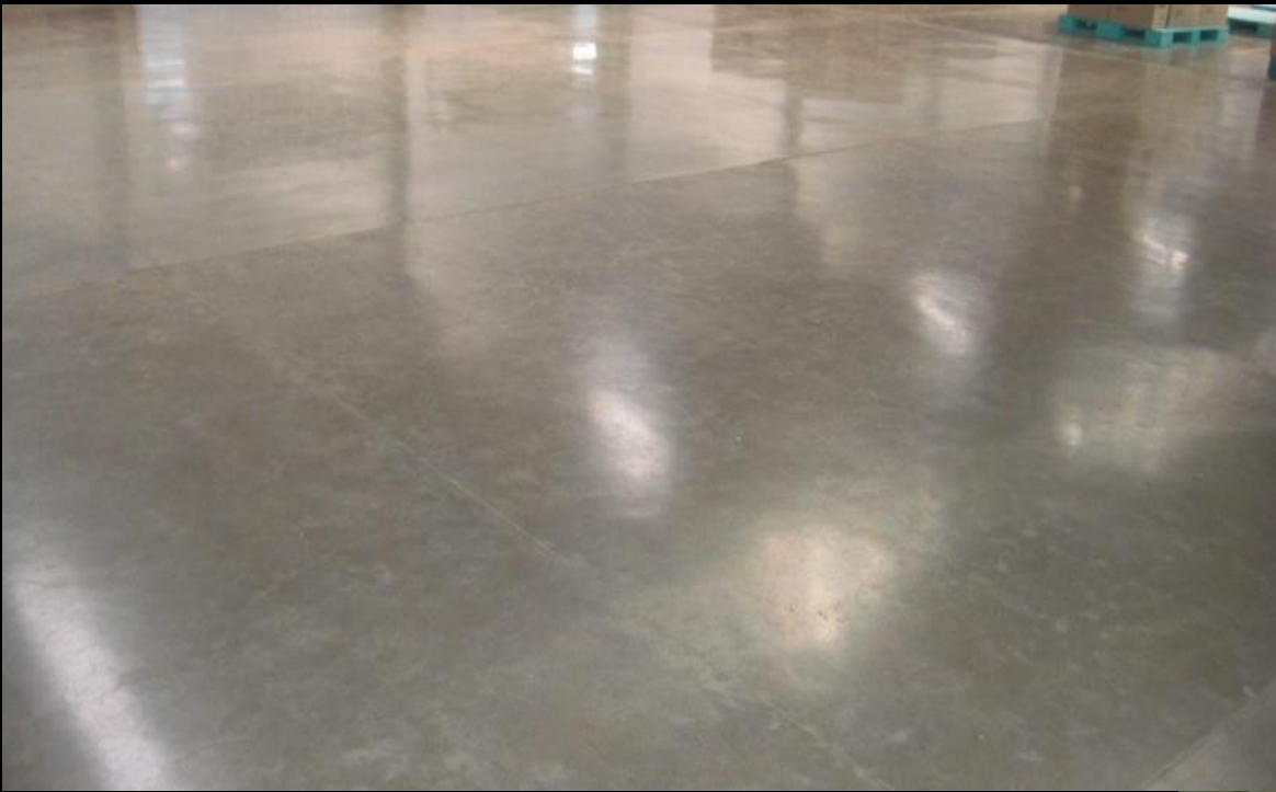
Cream Finish Look