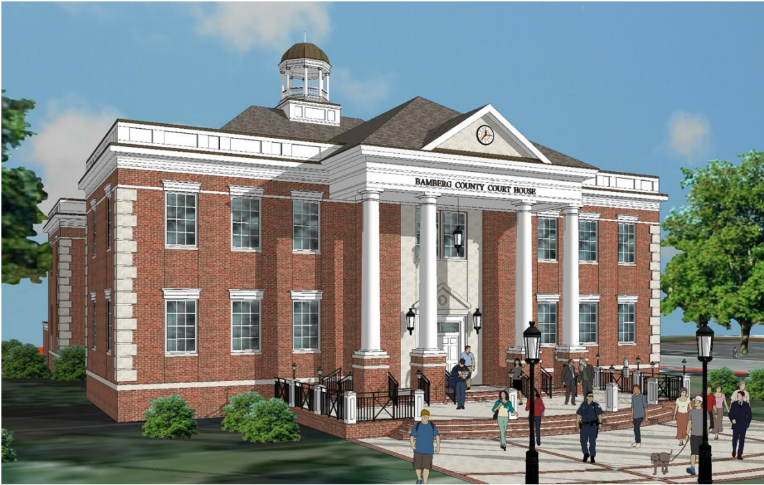
Proposed exterior for renovated Bamberg County Courthouse

1234 NORTH STREET P.O. BOX 149 BAMBERG, SOUTH CAROLINA 29003 Phone: (803) 245-5191 Fax: (803) 245-3027