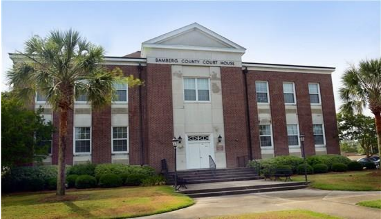
Bamberg County Courthouse in 2018