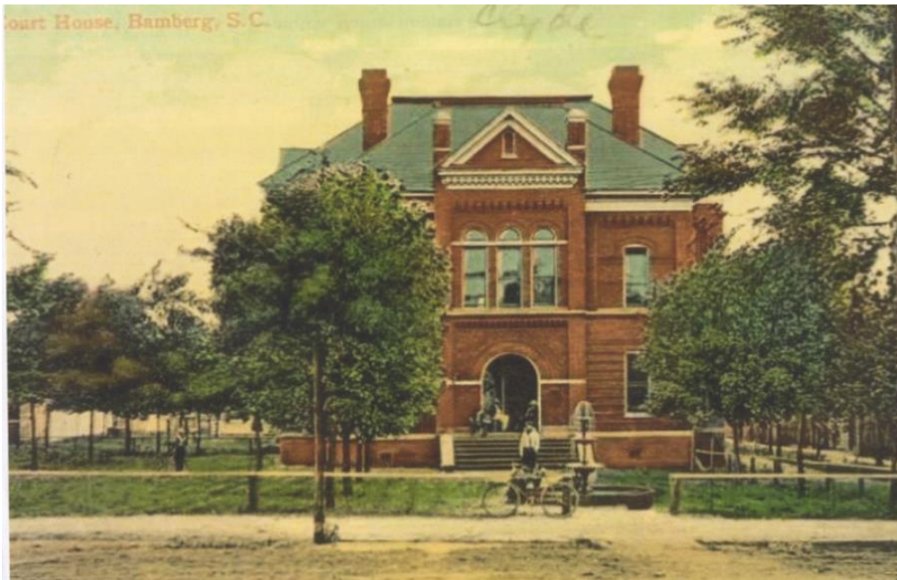
Bamberg County Courthouse in 1897