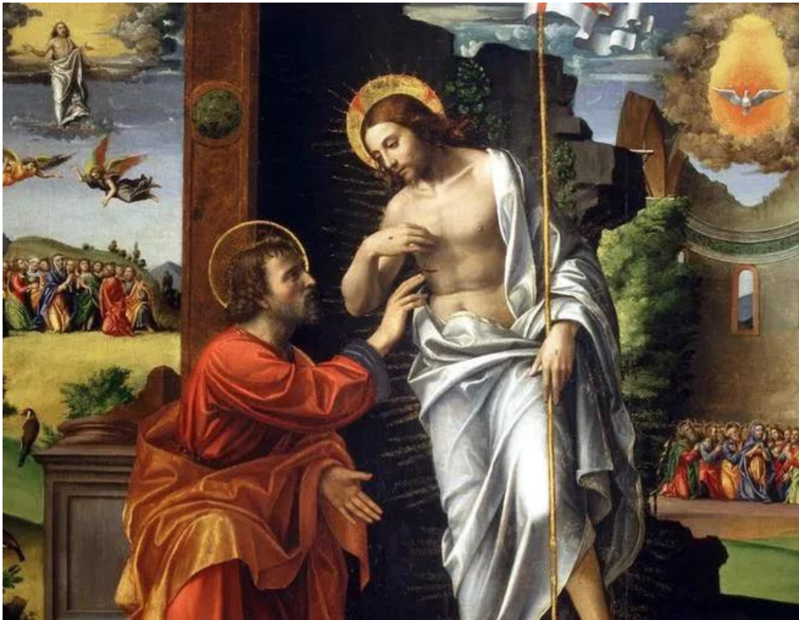
Paolo Moranda Cavazzola, "The Incredulity of St. Thomas," 1520

Second Sunday of Easter Divine Mercy Sunday