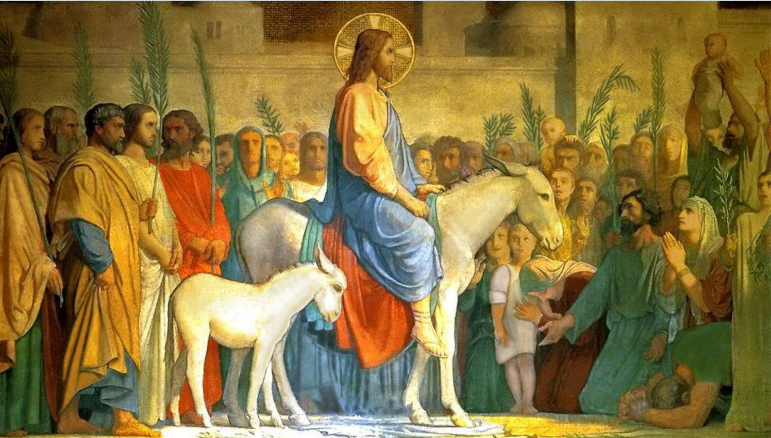
The Entrance of Christ into Jerusalem 1844 by Jean-Hippolyte Flandrin

Palm Sunday of the Passion of the Lord, Year B