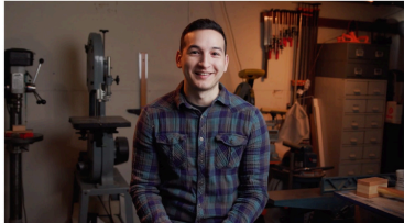
Never Alone Session 1: Belonging