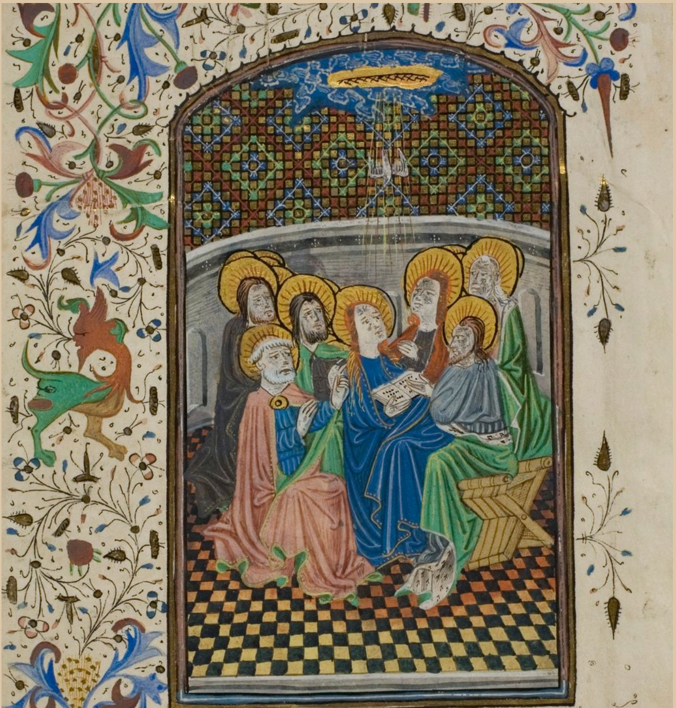
The Pentecost, from a Book of Hours (1430, French)