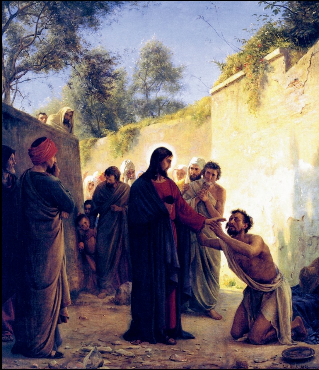
Healing of the Blind Man by Jesus Christ Carl Heinrich Bloch 1834-1890