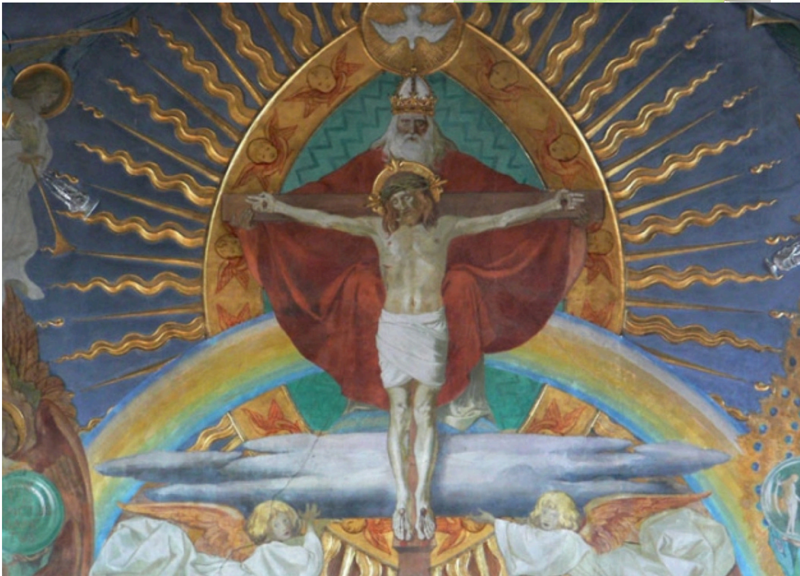
"The Altarpiece of the Holy Cross"

by Adam Elsheimer, painted between 1603 and 1605