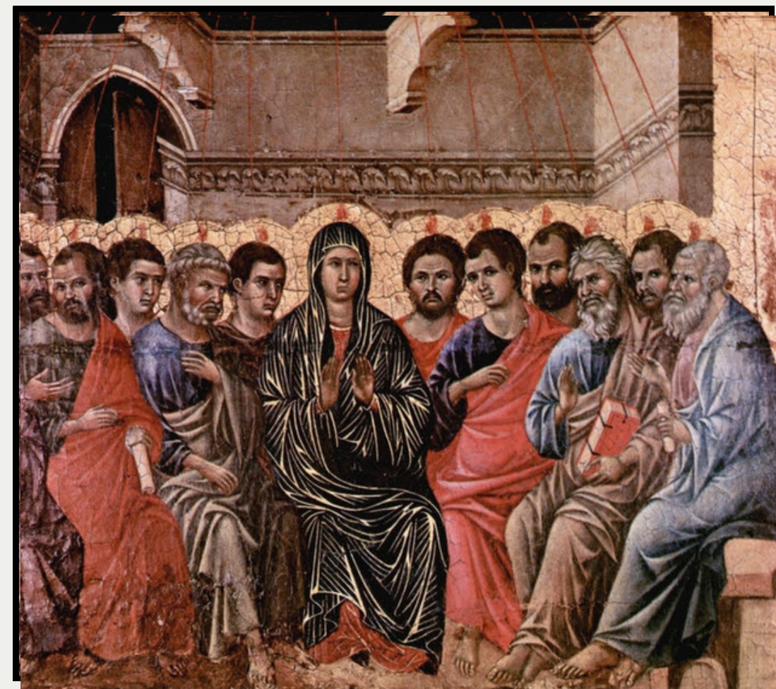
Panel from the Maesta Altarpiece of Siena Duccio, di Buoninsegna, d. 1319