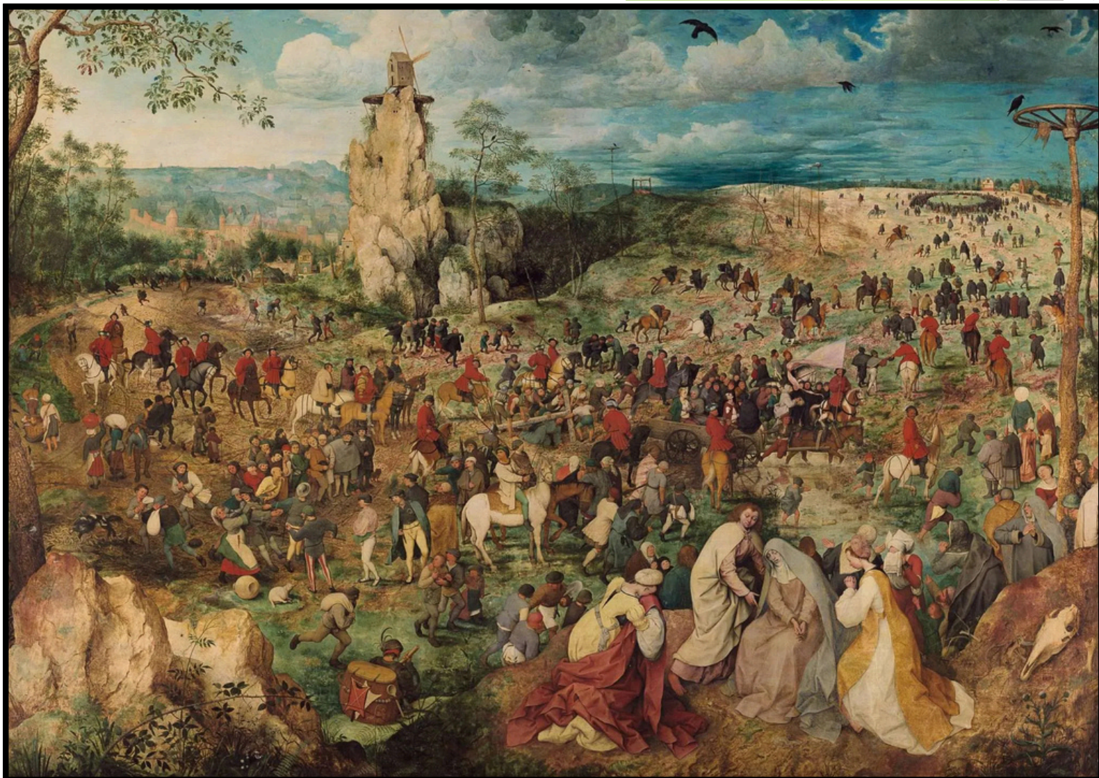
The Procession to Calvary, Painted by Pieter Breughel the Elder (1526-1569)