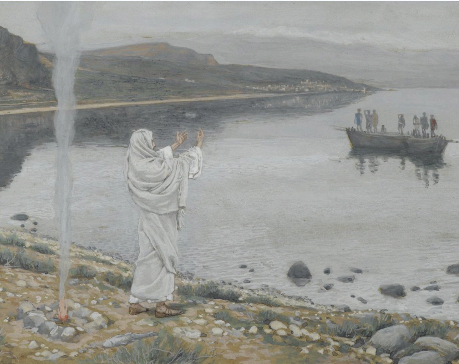
Christ Appears on the Shores of Lake Tiberias James Tissot 1836-1902