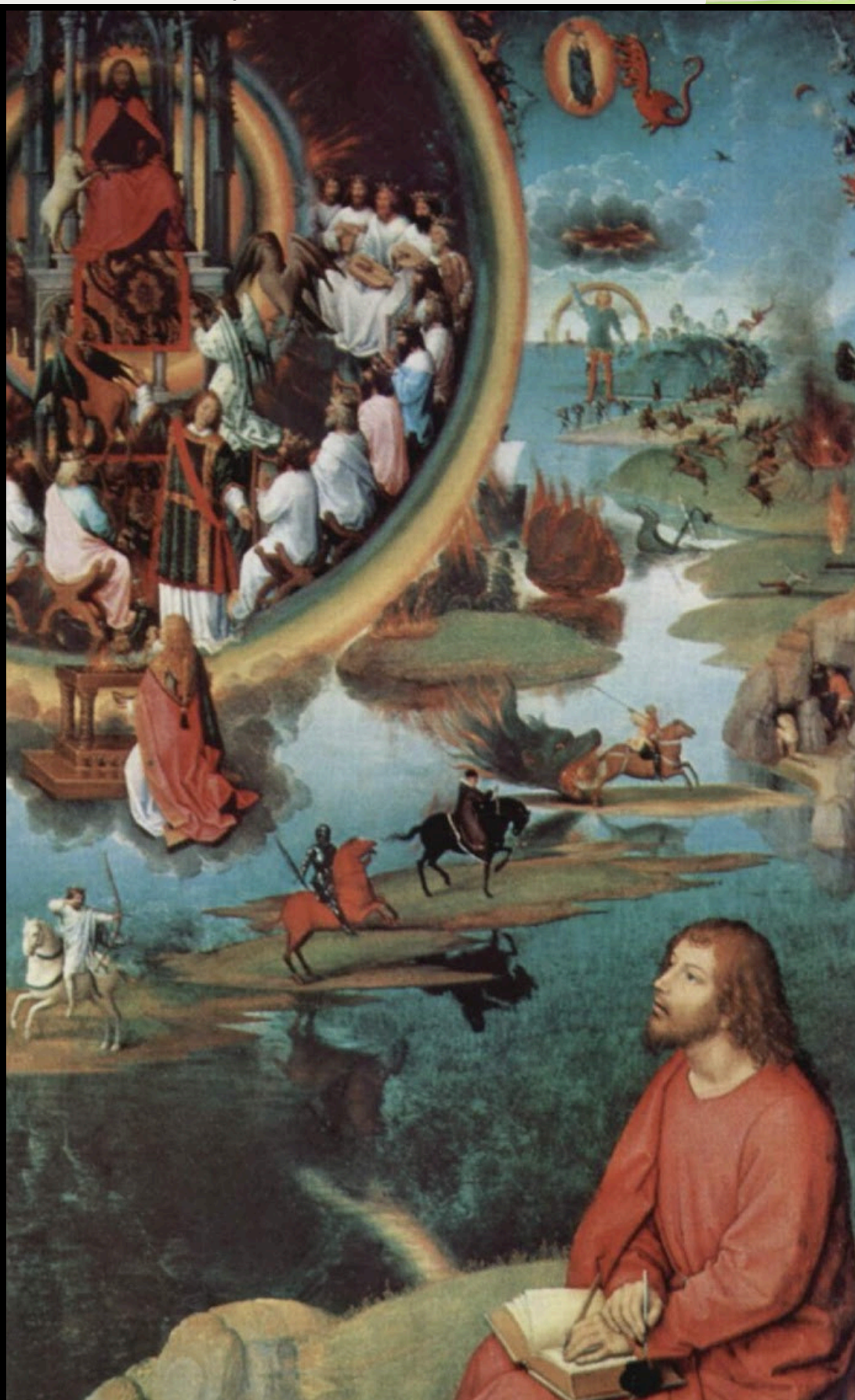
"John the Evangelist on Patmos and Visions of the Apocalypse" Hans Memling (circa 1433–1494)