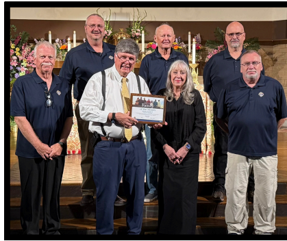
Knights of Columbus Family of the Month April 2025